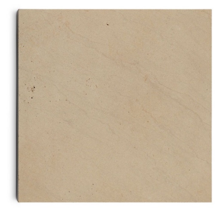
Photo E: Image of proposed 600 x 600mm 'Britannia Buff Sawn Yorkstone Paving' from London Stone

Photo D: Sample of proposed stone on existing misshapen stone tread