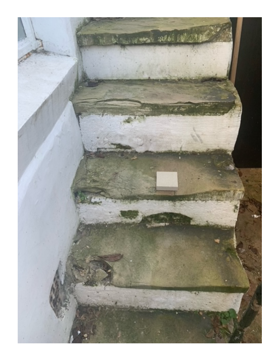
Photo C: Sample of proposed stone on existing misshapen stone tread

Photo B: Sample of proposed stone on existing lightwell floor finish