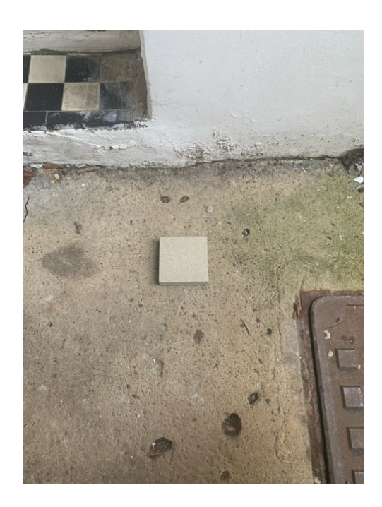
Photo B: Sample of proposed stone on existing lightwell floor finish