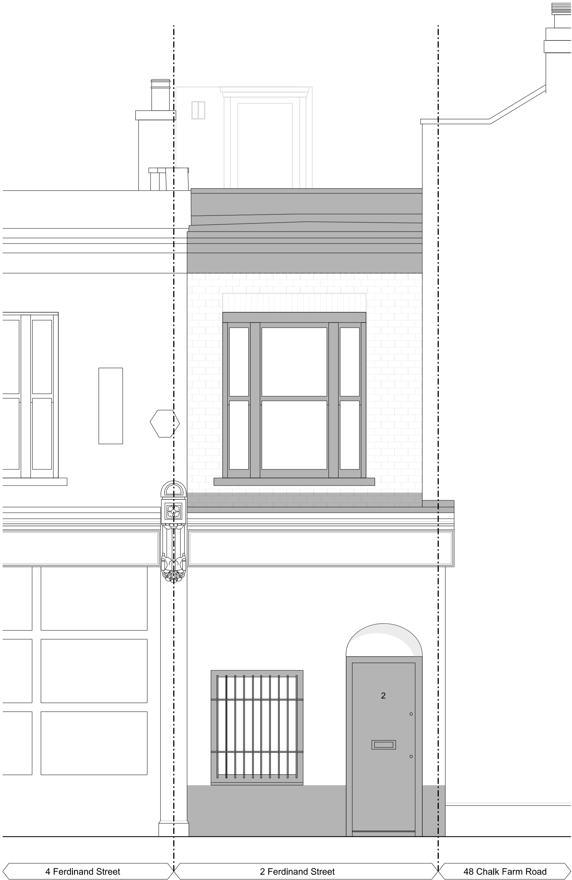
01 Existing Front Elevation Scale 1:25 @A1 / 1:50 @A3