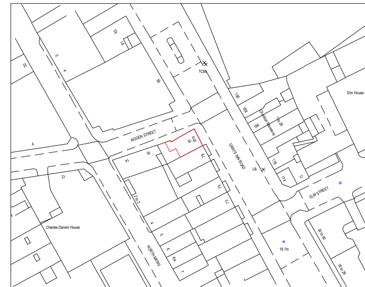
LOCATION PLAN SCALE 1:1250@A3

This drawing is the property of My Plan Ltd and may not be copied or reproduced without consent. All dimensions must be checked on site before commencing work. No dimensions to be scaled from drawing. My Plan Ltd asserts full Intellectual Property Rights in connection with designs, layouts and information contained within this drawing. Rights are transferred to the named client only upon receipt of full agreed payment in connection with services provided.