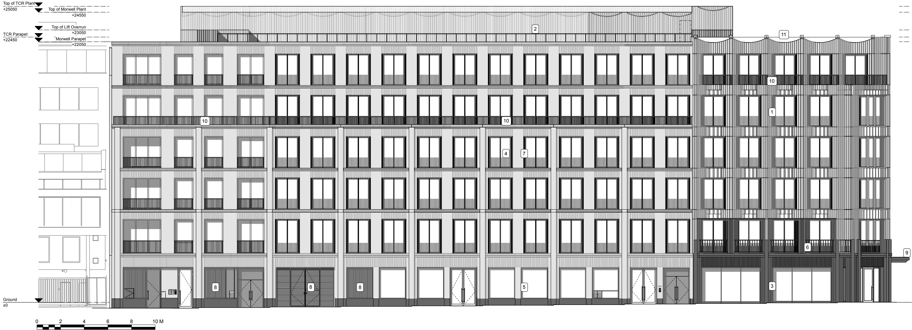
3 MOREWELL ST - EAST ELEVATION ST-PL-03-102 SCALE 1:200 @ A3