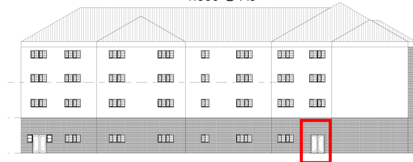
WEST ELEVATION PROPOSED 1:500 @ A3