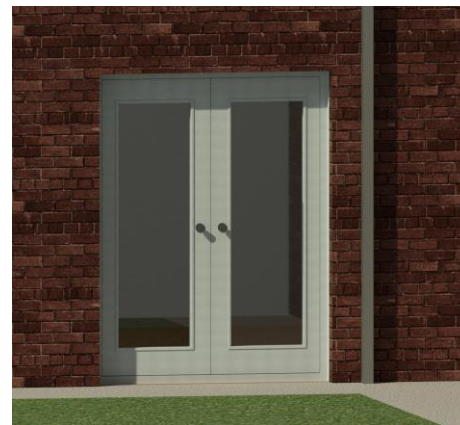
PROPOSED TIMBER FRAME GLAZED DOOR