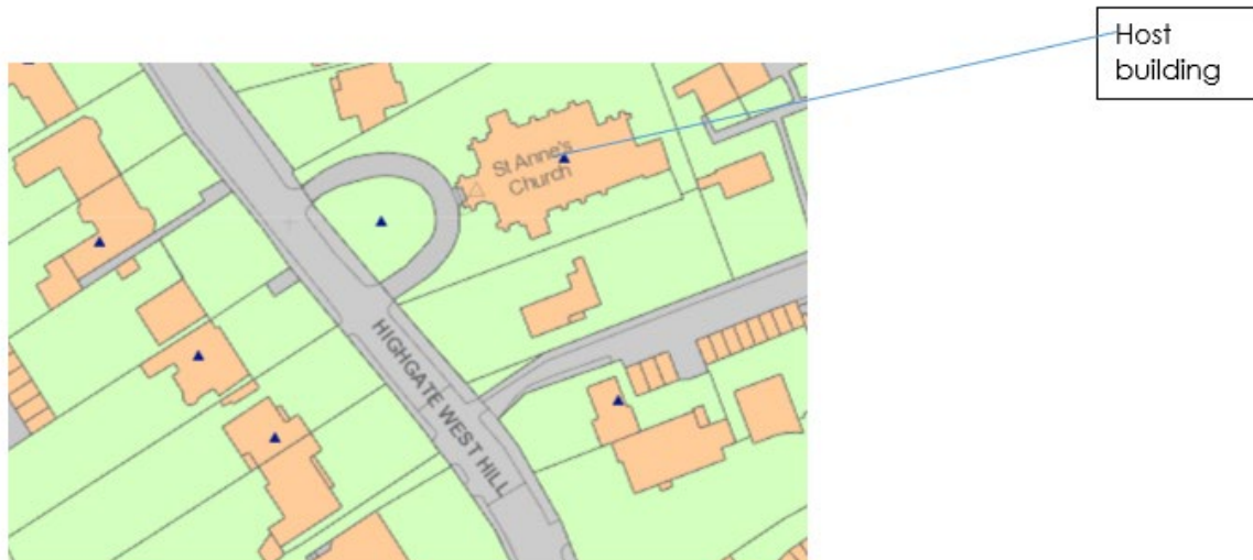
Map of Listed Buildings in the surrounding area extract taken from Historic England.

As can be seen from the above, there are a number of listed buildings in proximity to the site which are denoted by the blue triangles.