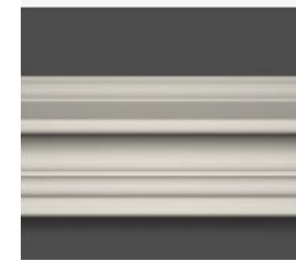
Proposed cornice details [ www.londonplastercraft.com : Product ID CR 237 S 'Georgian cornice' ]