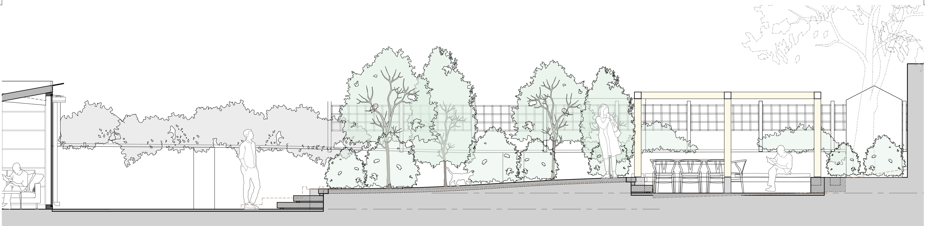
Garden Layout - Section