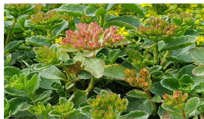
Sedum Floriferum Flowering Period: July-August Approx. Height: 10cm