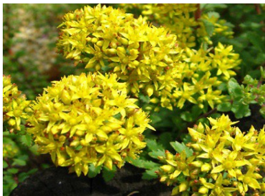
Sedum Selskianum 'Goldilocks' (true) Flowering Period: August-September Approx. Height: 20cm

All sedum species will create a comprehensive layer over green cover all year round with flowers appearing at different intervals throughout the spring and summer.