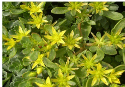
Sedum Hybridum 'Czar's Gold' Flowering Period: May-August Approx. Height: 15cm