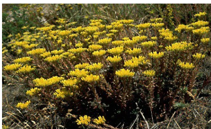
Sedum Momentum Flowering Period: June-August Approx. Height: 20cm