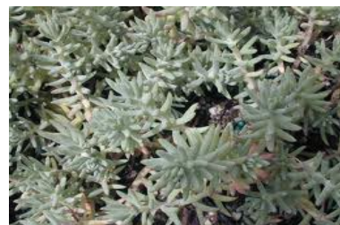
Sedum Montanum ssp Orientale Flowering Period: June-August Approx. Height: 20cm