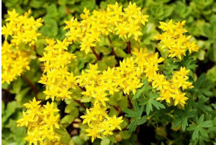
Sedum Acre Flowering Period: June-August