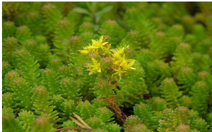
Sedum Sexangulare Flowering Period: July-August Approx. Height: 8cm