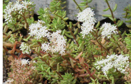
Sedum Album Flowering Period: June-August Approx. Height: 10cm