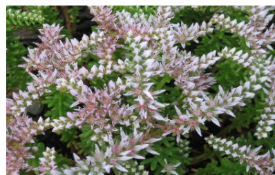
Sedum Pulchellum Flowering Period: May-July Approx. Height: 10cm