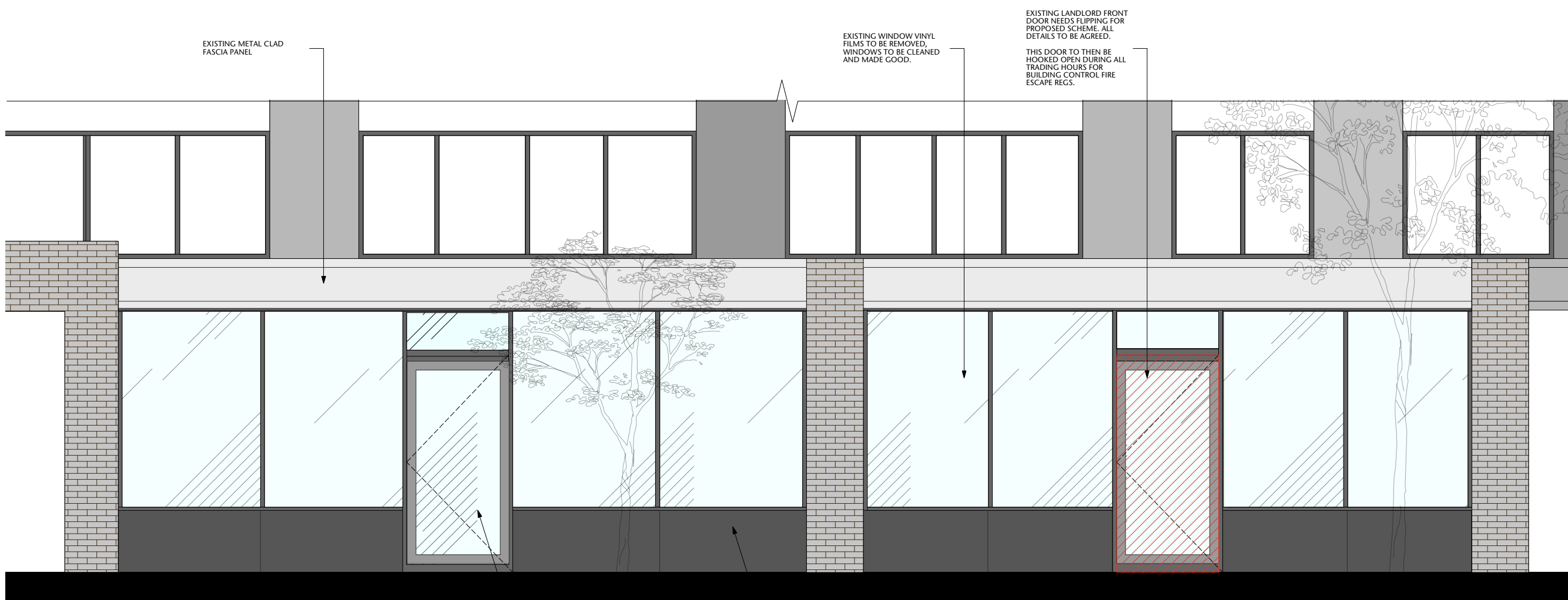
2 EXISTING SHOPFRONT: ELEVATION A SCALE 1:25@A1 / 1:50 @A3