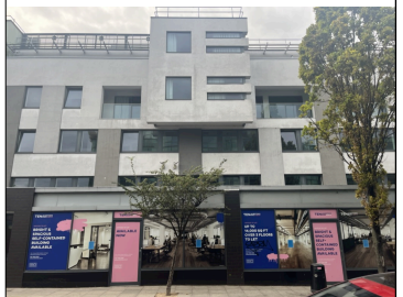
PHOTO - EXISTING SHOPFRONT

A 14.02.23 EXISTING CENTRAL BRICK COLUMN REVISED TO BE FULL HEIGHT TO MATCH EXISTING SITE.