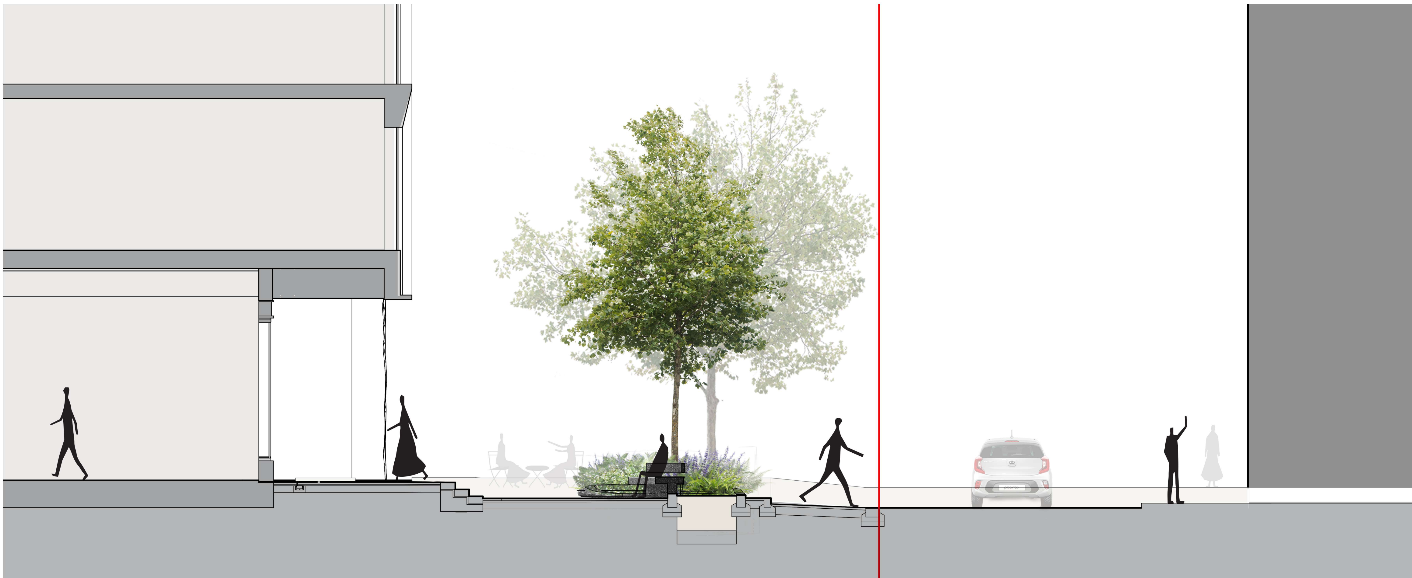
Public Realm - Proposed Site Section FF