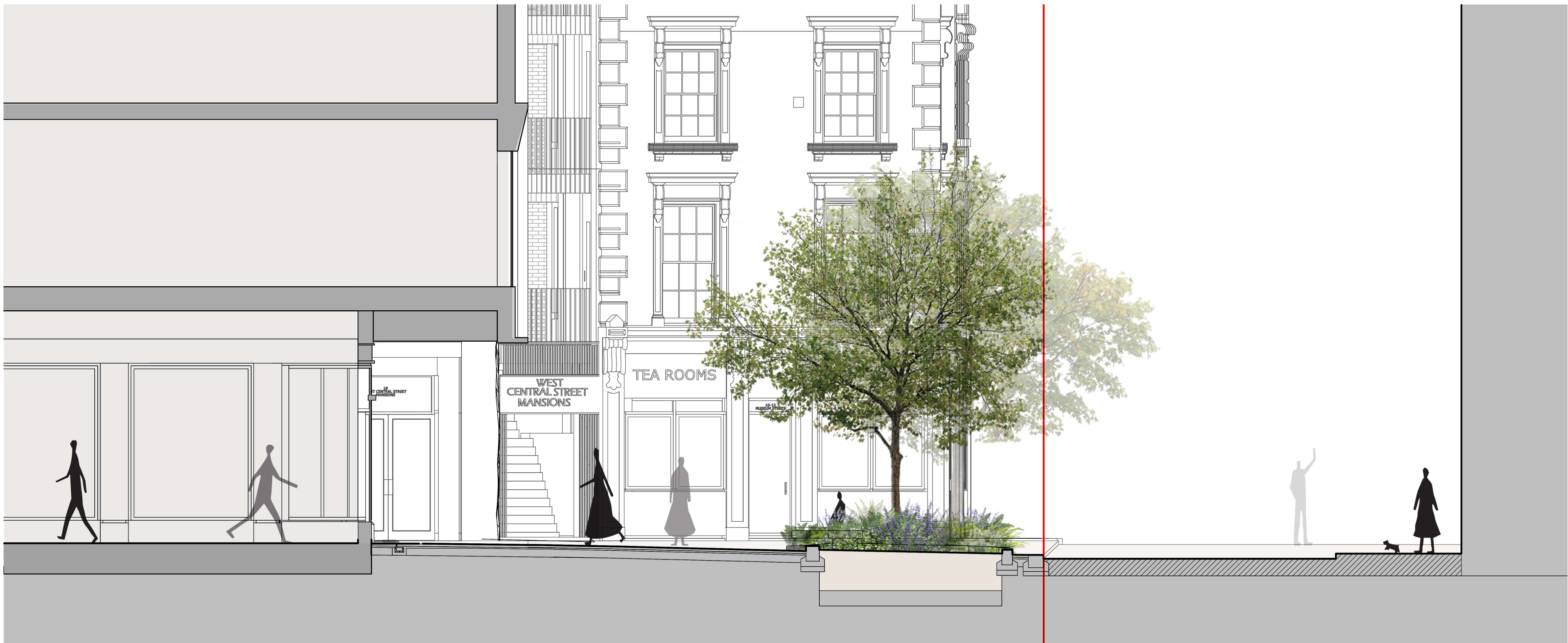
Public Realm - Proposed Site Section EE