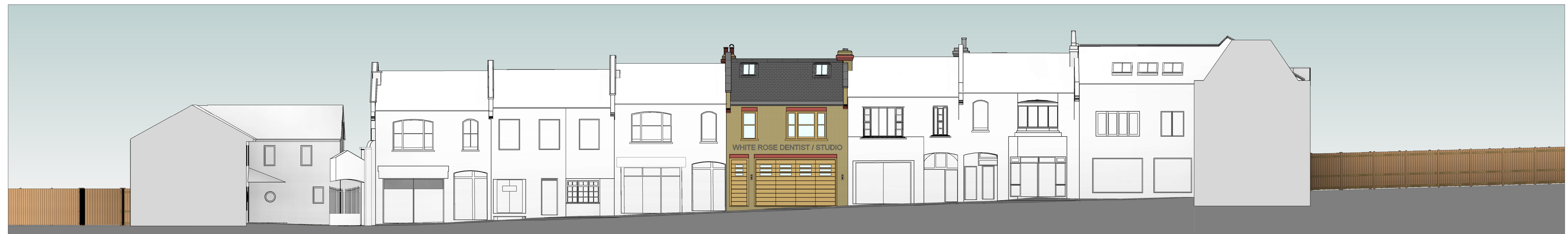
3 STREET SECTION 1 1:100