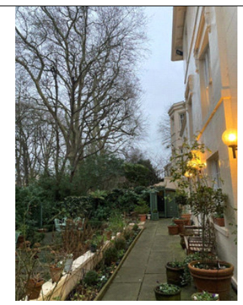
Vegetation to rear of property