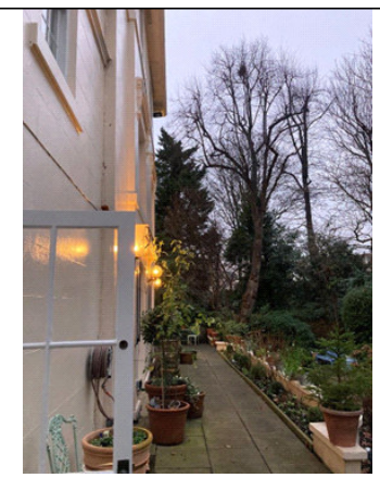
Vegetation to rear of property

See the accompanying report for more photographs