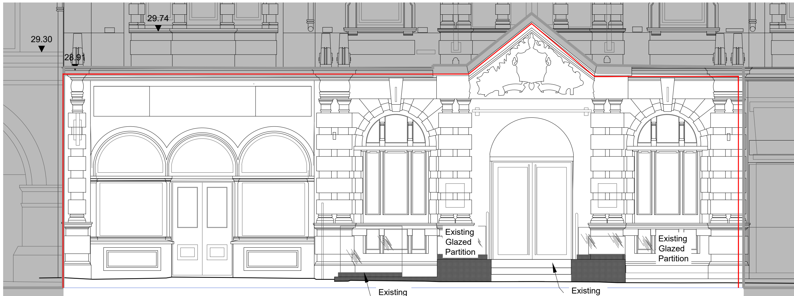
EXISTING ELEVATION Scale 1:50