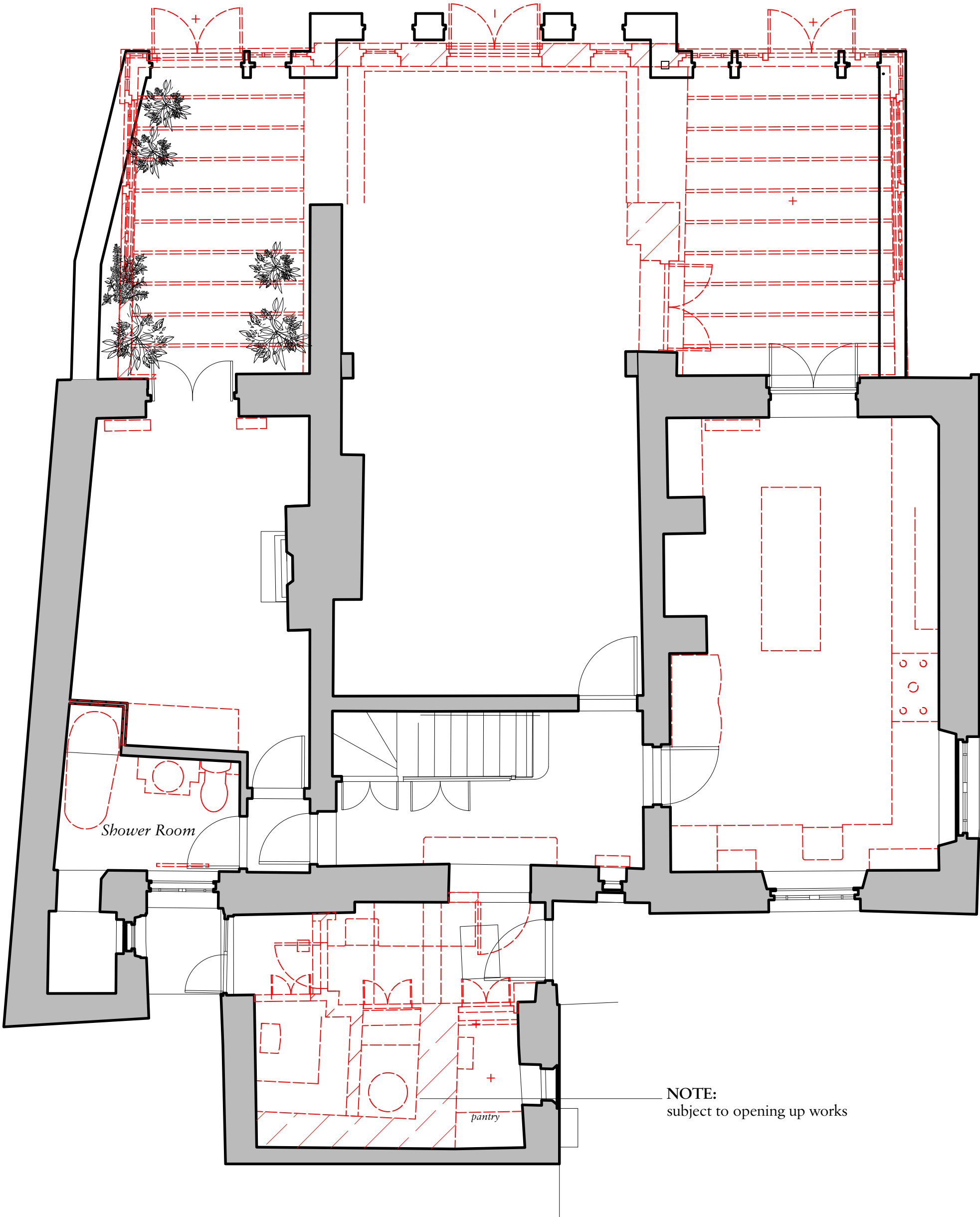
Proposed Lower Ground Floor Removals Plan 1:50