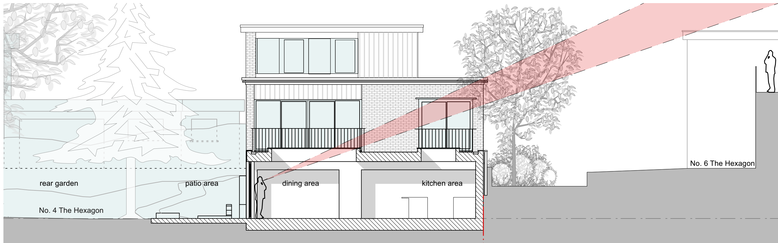
Section BB - View from property at number 4