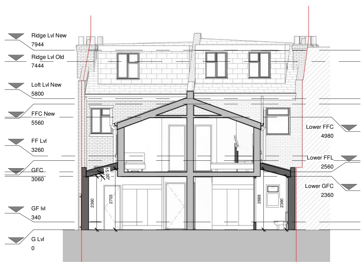
Section 2 1 : 100