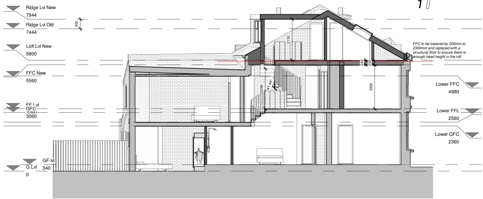
Section 1 1 : 100