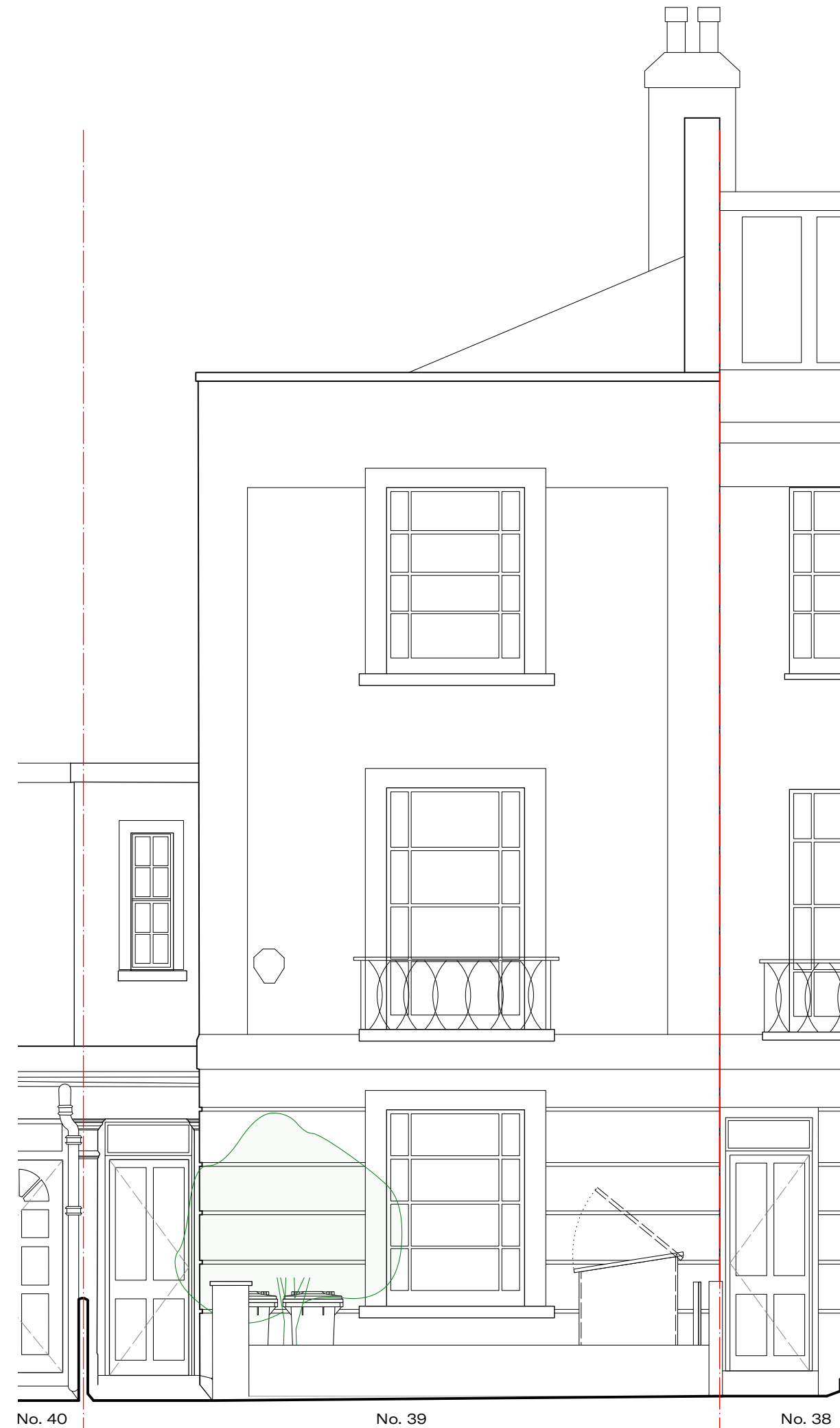
Street Elevation as proposed