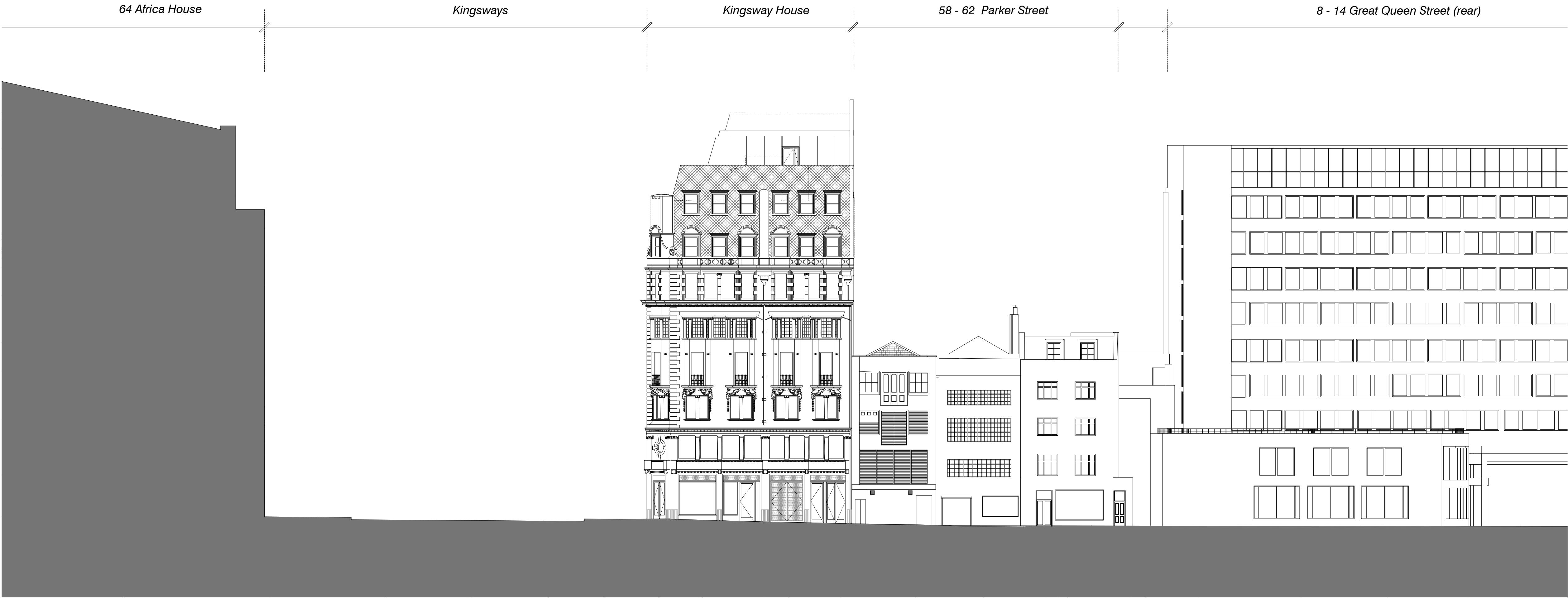
01 Parker Street Elevation 1.200