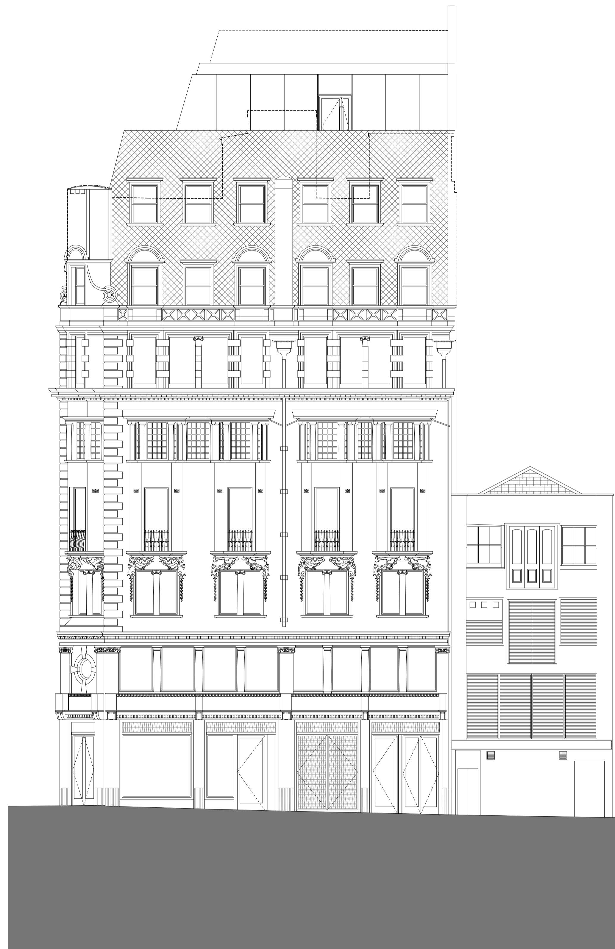
01 Parker Street Elevation 1.100

FFL - 57.163mm PLANT FFL - 54.813mm ROOF FFL - 51.177mm L8 EFL - 49.470mm FFL - 47.691mm L7 EFL - 46.440mm FFL - 44.205mm L6 EFL - 43.370mm FFL - 40.719mm L5 EFL - 40.180mm FFL - 37.233mm L4 EFL - 36.950mm FFL - 33.747mm L3 EFL - 33.570mm FFL - 30.261mm L2 EFL - 30.180mm FFL - 26.775mm L1 EFL - 26.500mm FFL - 22.275mm GF EFL - 22.200mm FFL - 18.650mm LG EFL - 18.650mm DATUM - 16.000mm