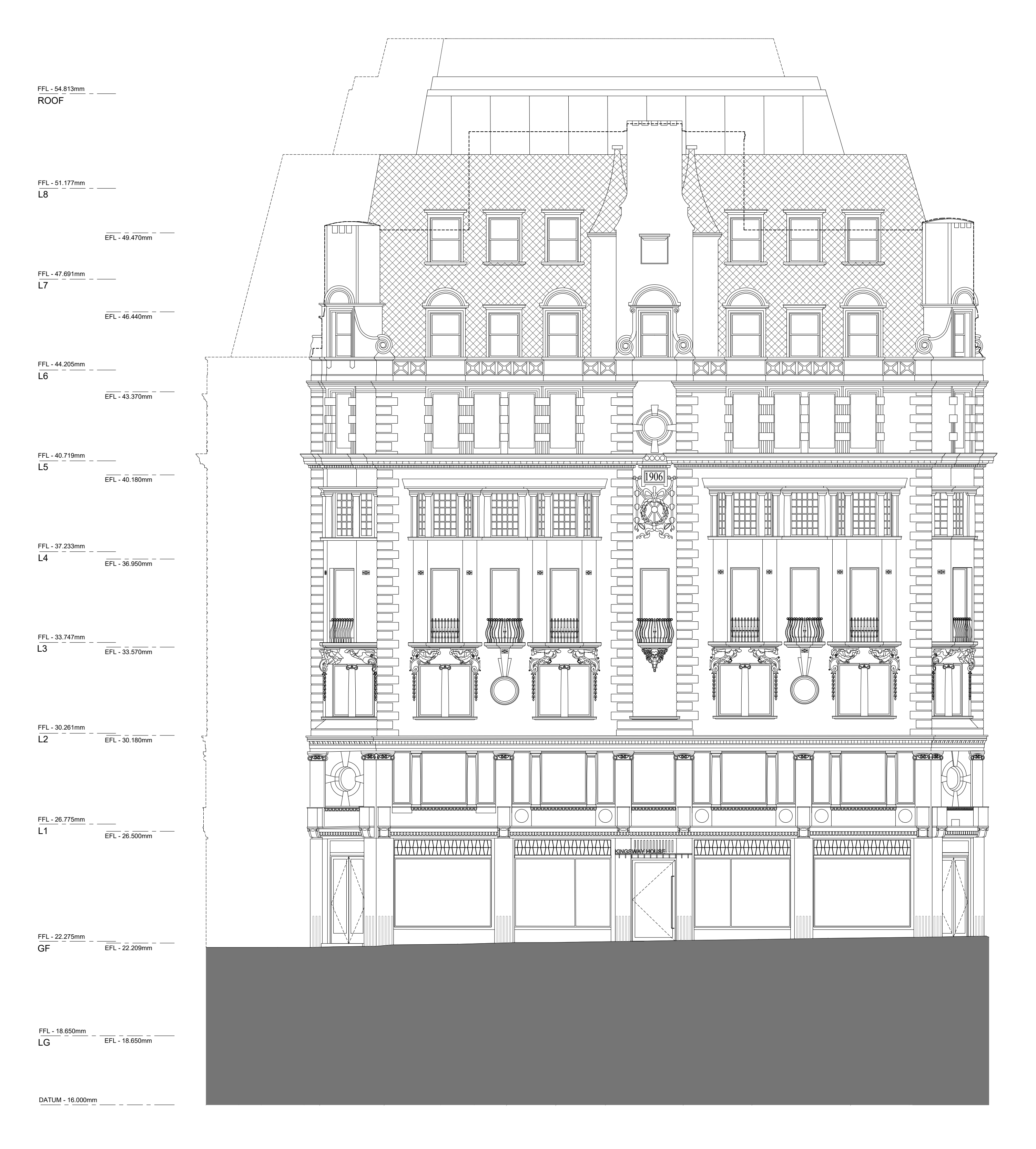
01 Kingsway Elevation 1.100