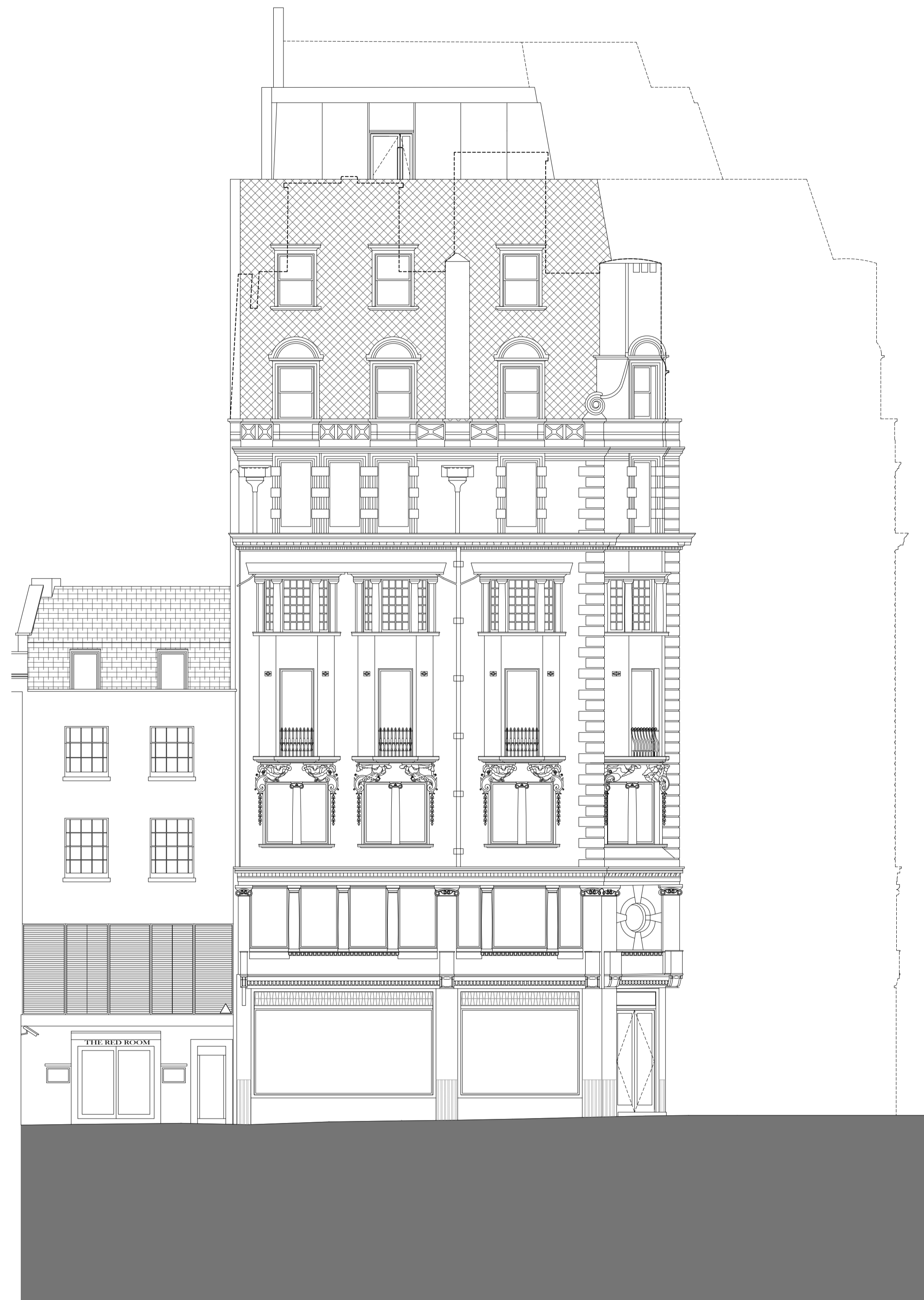
01 Great Queens Street Elevation 1.100

FFL - 57.163mm PLANT FFL - 54.813mm ROOF FFL - 51.177mm L8 FFL - 47.691mm L7 FFL - 44.205mm L6 FFL - 40.719mm L5 FFL - 37.233mm L4 FFL - 33.747mm L3 FFL - 30.261mm L2 FFL - 26.775mm L1 FFL - 22.275mm GF FFL - 18.650mm LG DATUM - 16.000mm