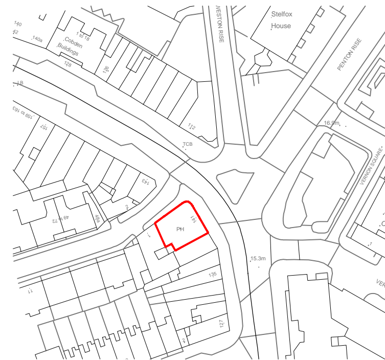
LOCATION PLAN SCALE 1:1250 @ A3