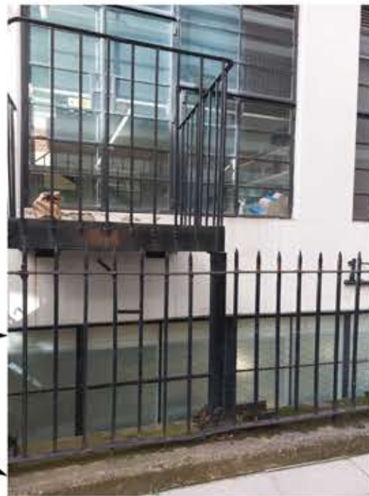
Existing Railings at Pavement Level

Concrete Upstand to rear of pavement to be removed to create flush bike platform