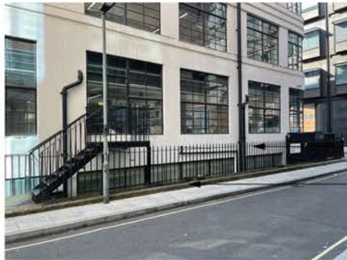
Existing Elevation 10 (Shropshire Place)

Portion of Railing to be removed to facilitate new bike store