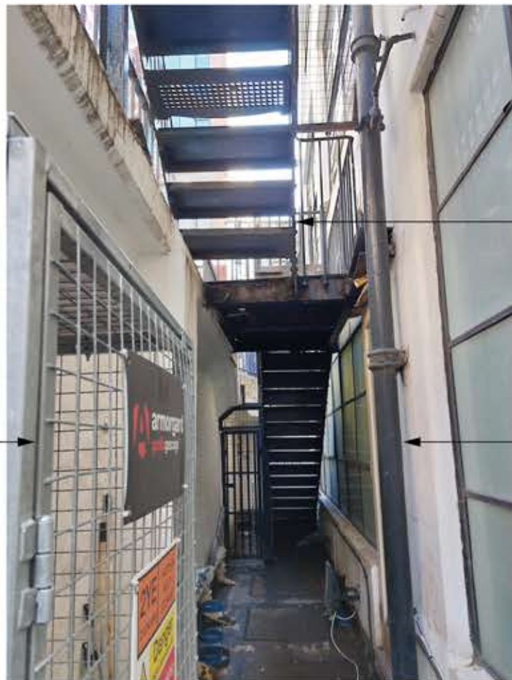
Existing Lower GF Light Well