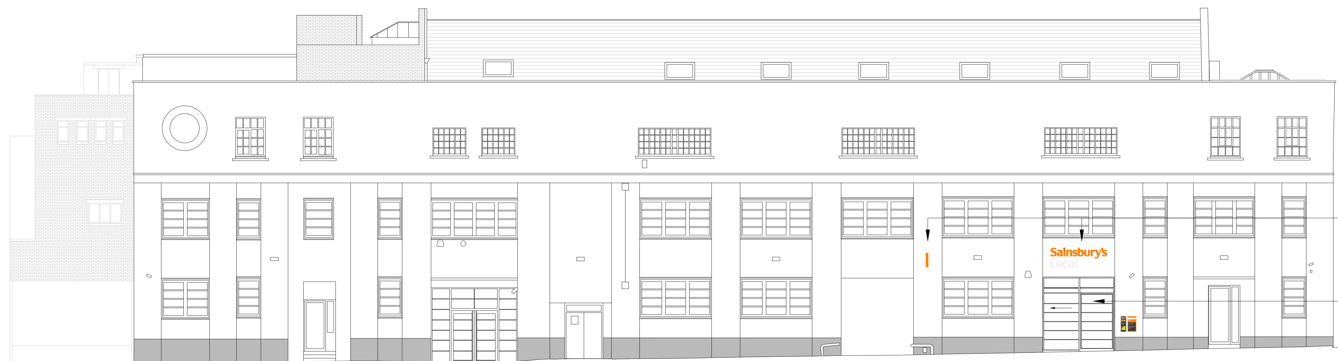
Proposed Elevation 1