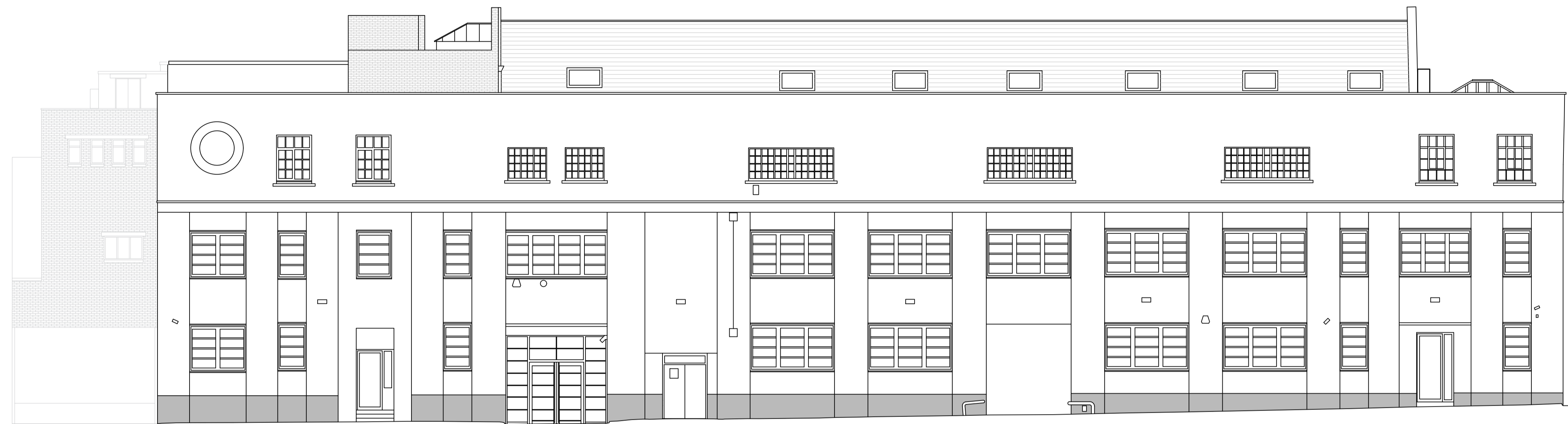
Existing Elevation 1