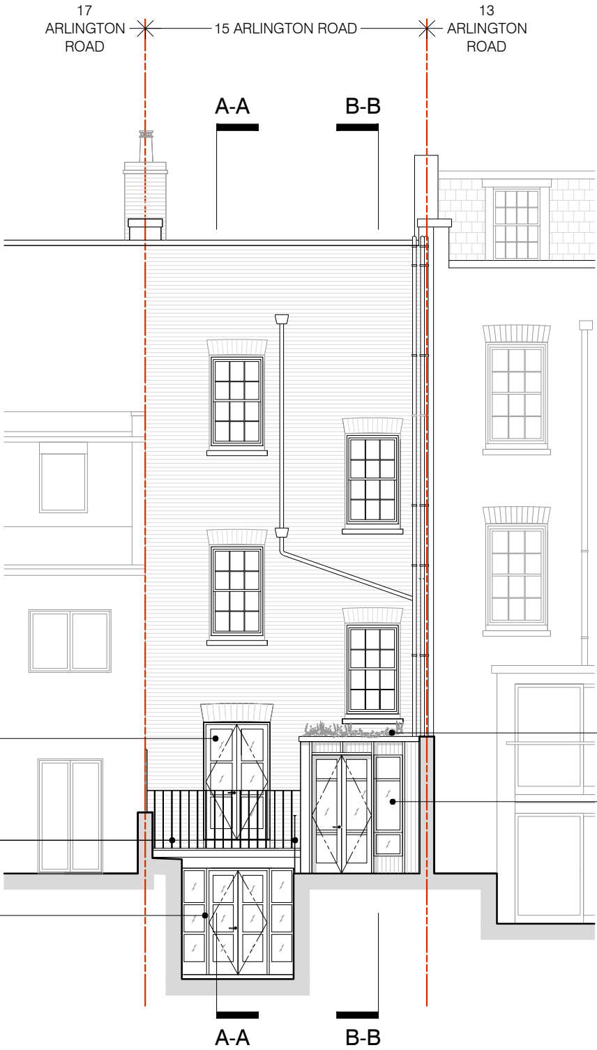
02 PROPOSED REAR ELEVATION scale 1:100

proposed timber framed glazed doors as approved in application ref: 2021/3491/P