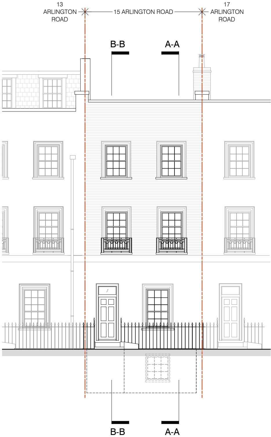
01 PROPOSED FRONT ELEVATION scale 1:100