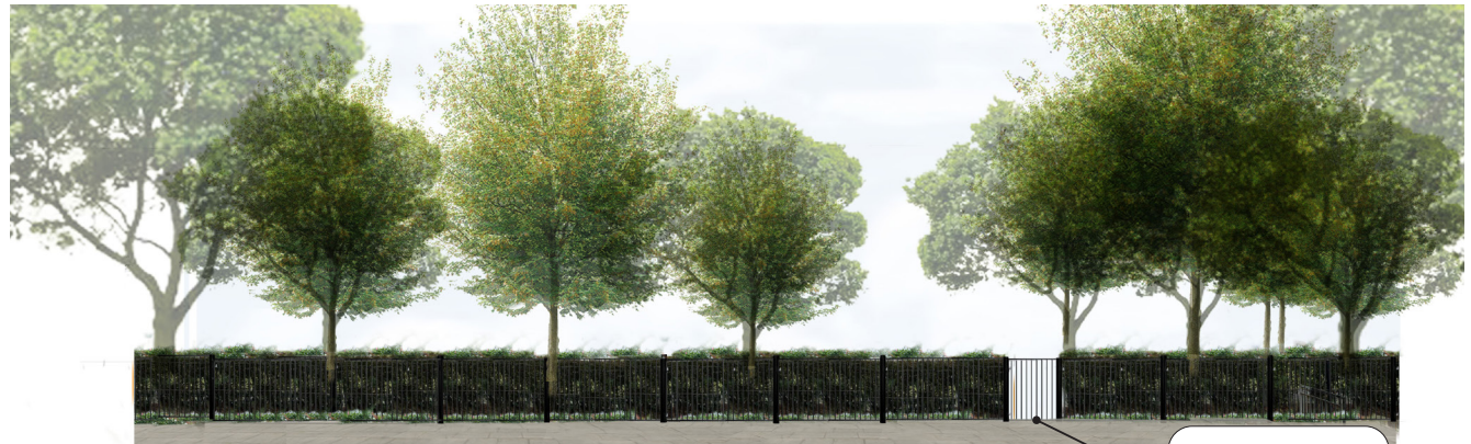
Section along proposed new gate/entrance to the playground