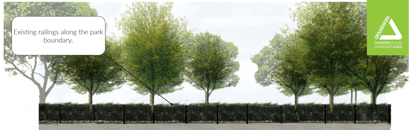
Section along existing northern entrance boundary of playground and location of new gate/ entrance

The new gate is being proposed in the gap between two existing trees. New shade tolerant planting will be planted around this new entrance as part of a larger planting programme for the whole park.