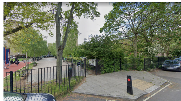
Existing access to site from the northern entrance