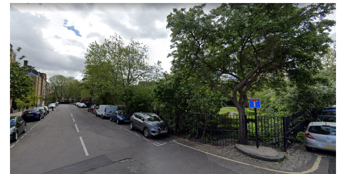
Existing boundary of playground and location of new gate/ entrance