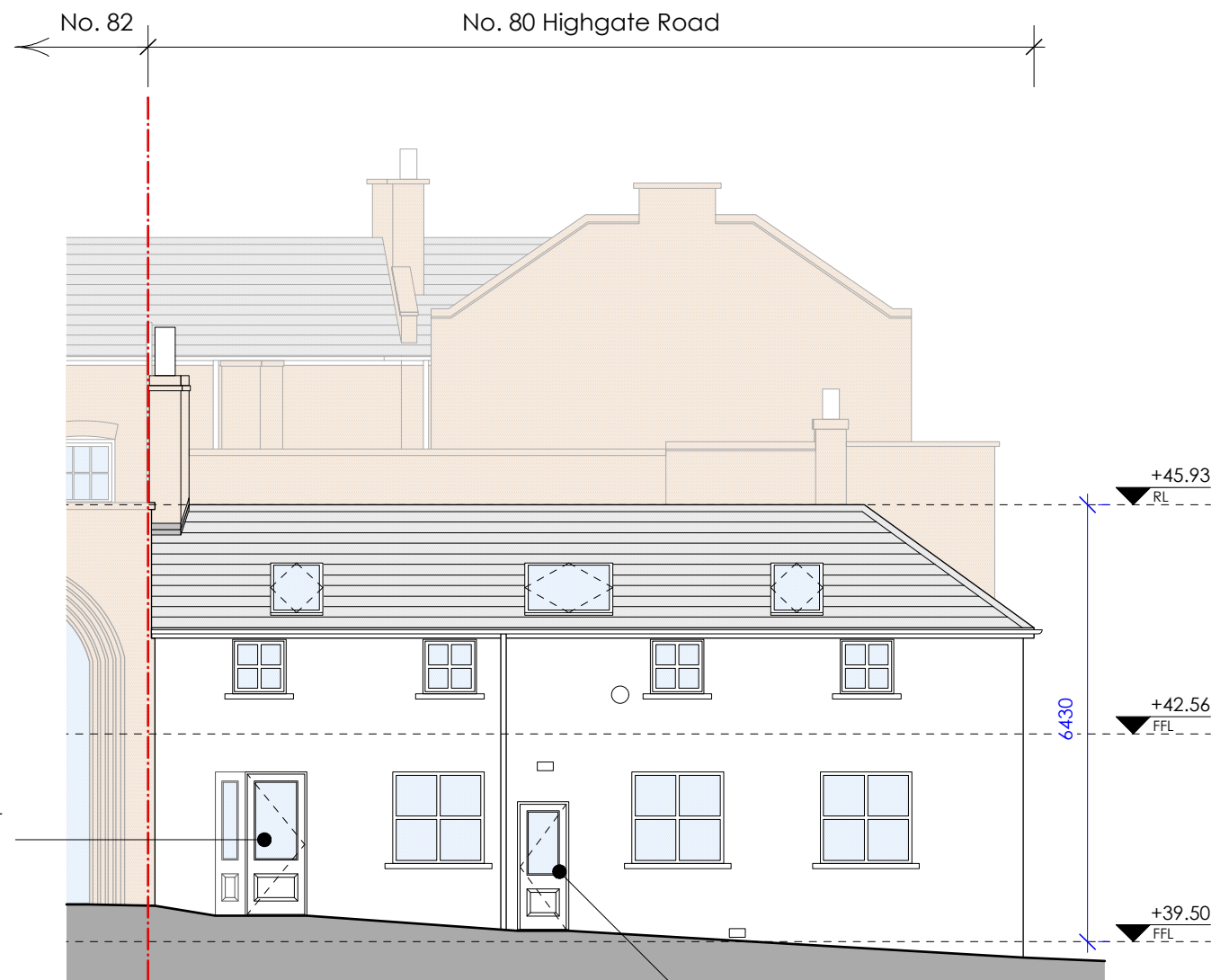
2 Proposed Side Elevation Scale: 1:100