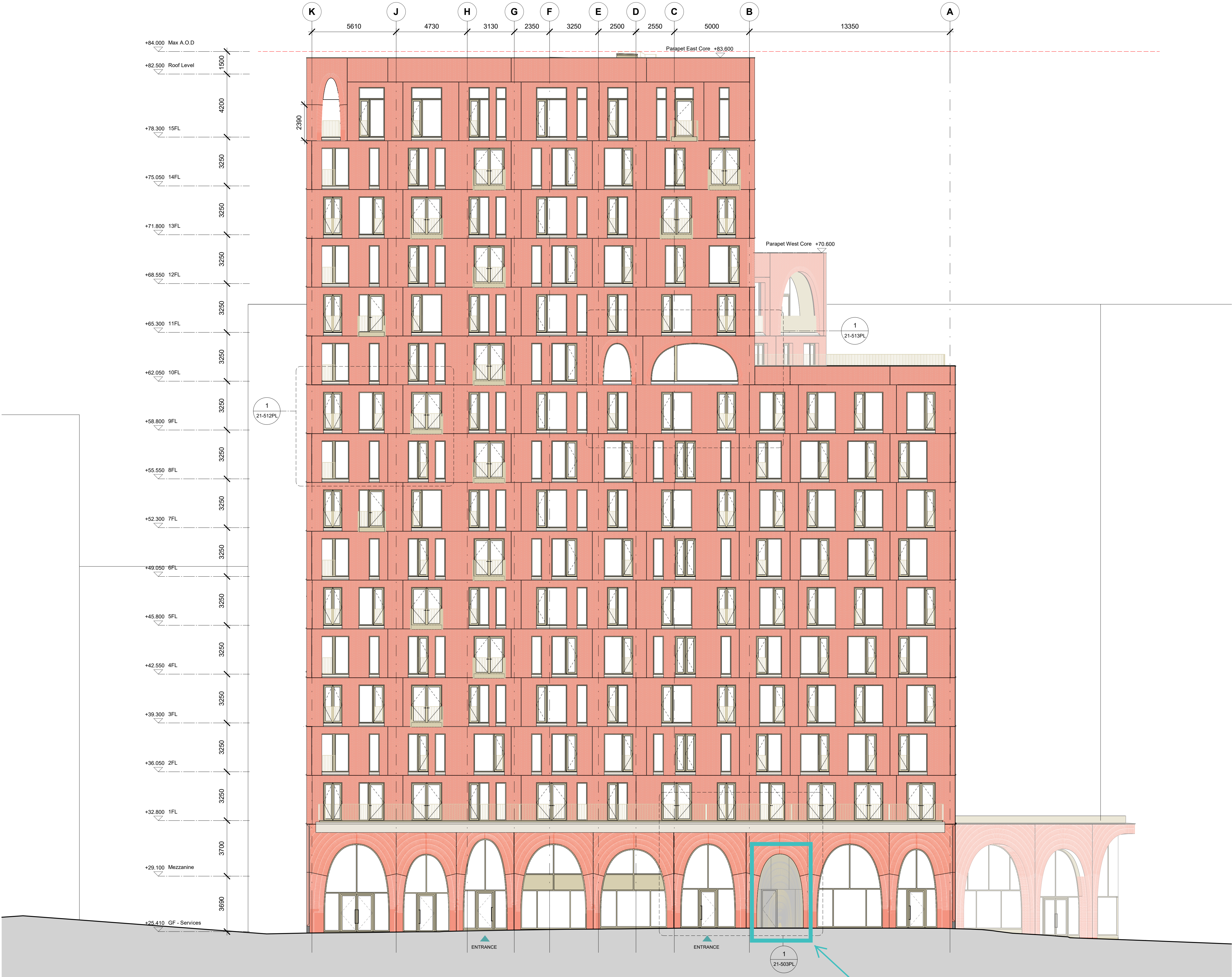
1 East Elevation 1 : 125