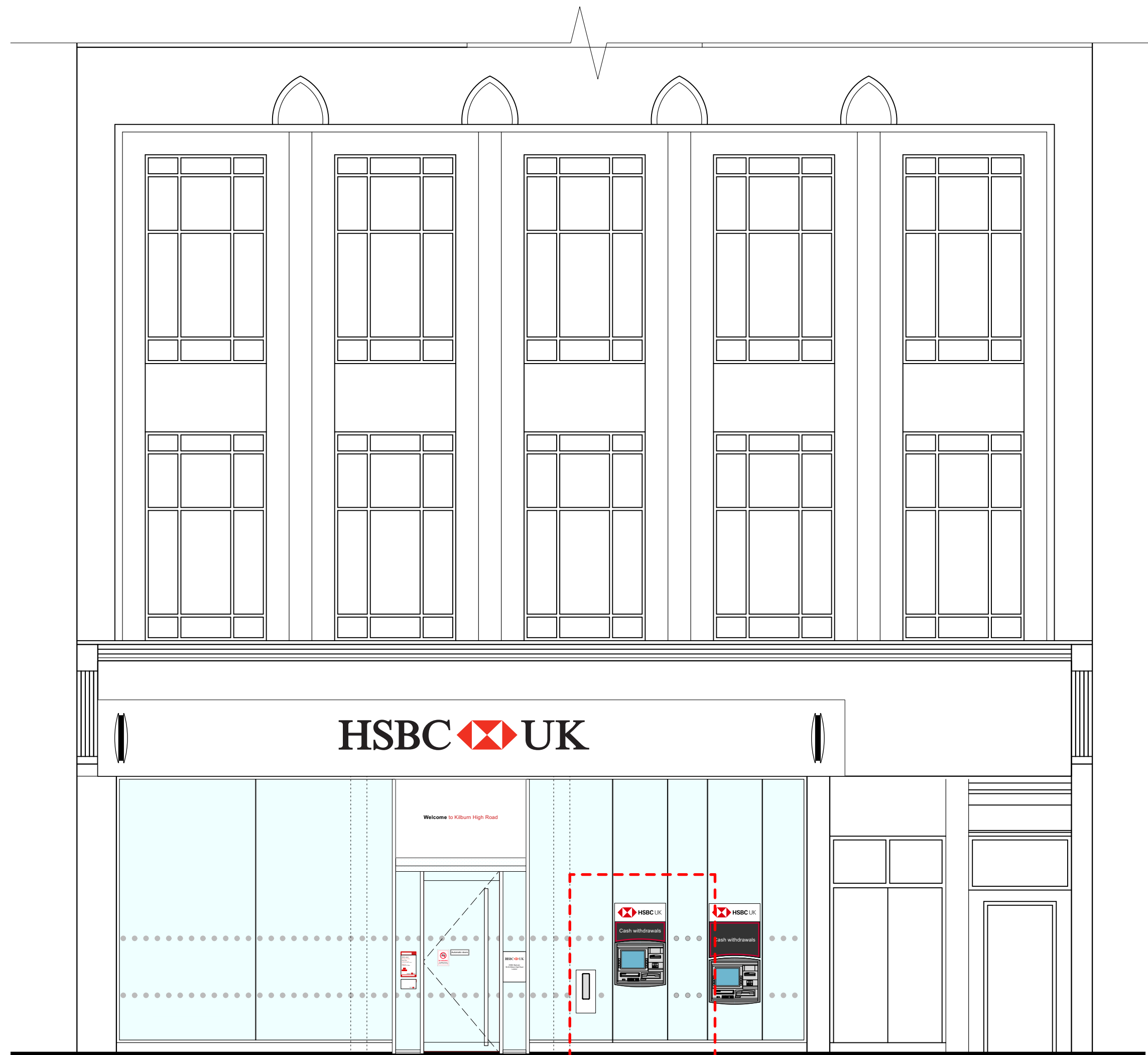
02 Southwest Elevation Indicating Affected Area 1:100@A3 / 1:50@A1