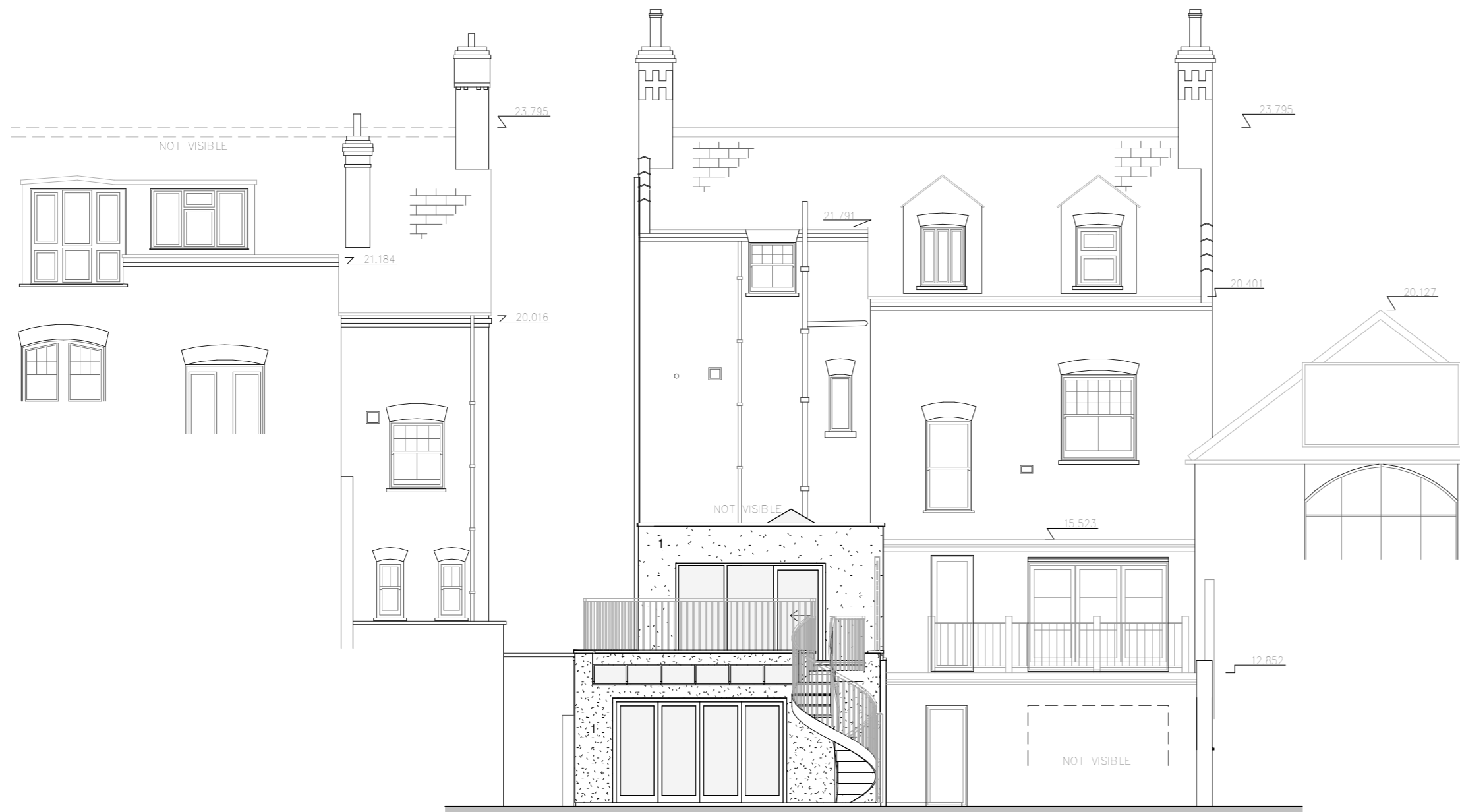
1 07.3 North elevation - as proposed p304B 1 : 100