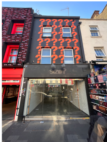
REFERENCE IMAGE No.1: EXISTING SHOPFRONT