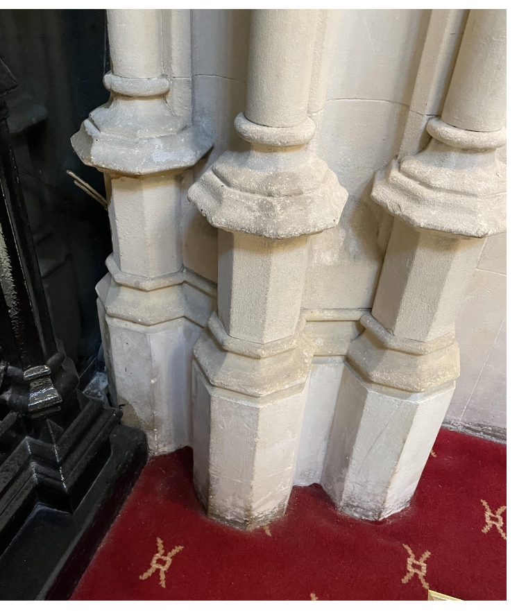
3 Junction between the lift and the wall