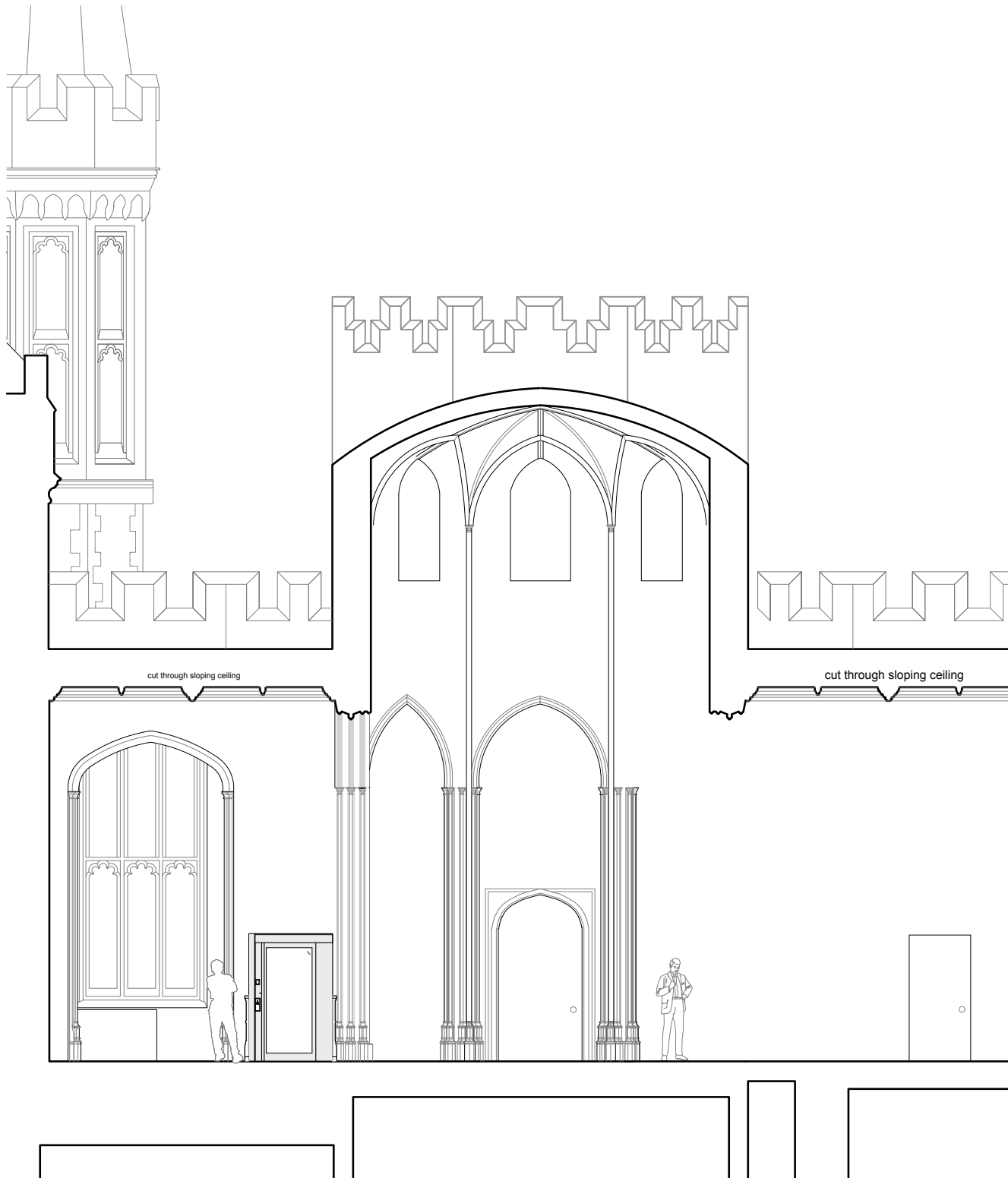
3. Proposed Elevation C Scale 1:100

Proposed Lift Specification: Cibes Platform Lift Type A5000/AIR Platform Lift Size 16 Car Size: 1100mm W x 1467mm D Shaft size: 1460mm W x 1515mm D ** Cut out size: 1500mm W x 1580mm D Headroom: 2450mm Travel: 3820mm Gr Fl to 1st Fl Door type: AL5 single hinged door with 900x2070mm glazed panel