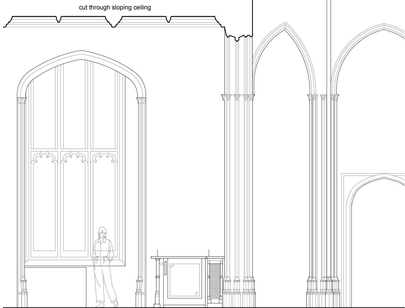
1. Existing elevation C1 Scale 1:50