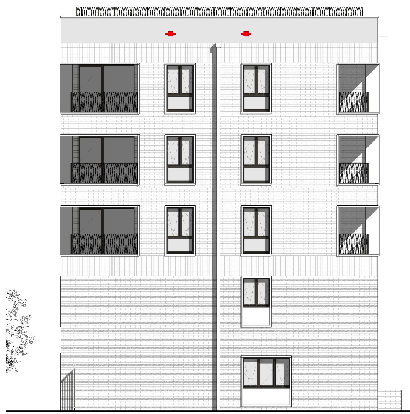
1 East Elevation (Courtyard) - Planning 1 : 100