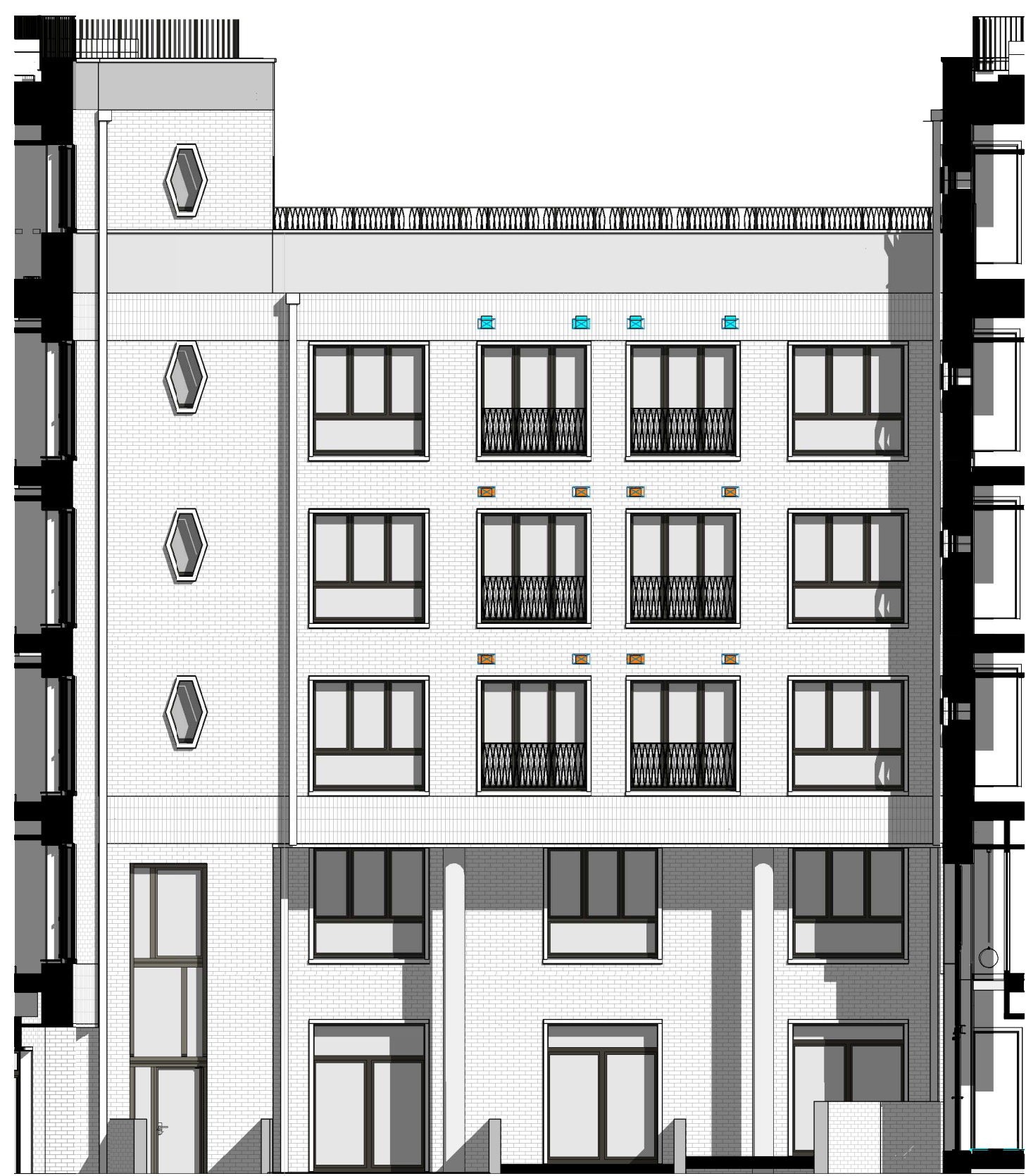
4 South Elevation (Courtyard) - Planning 1 : 100