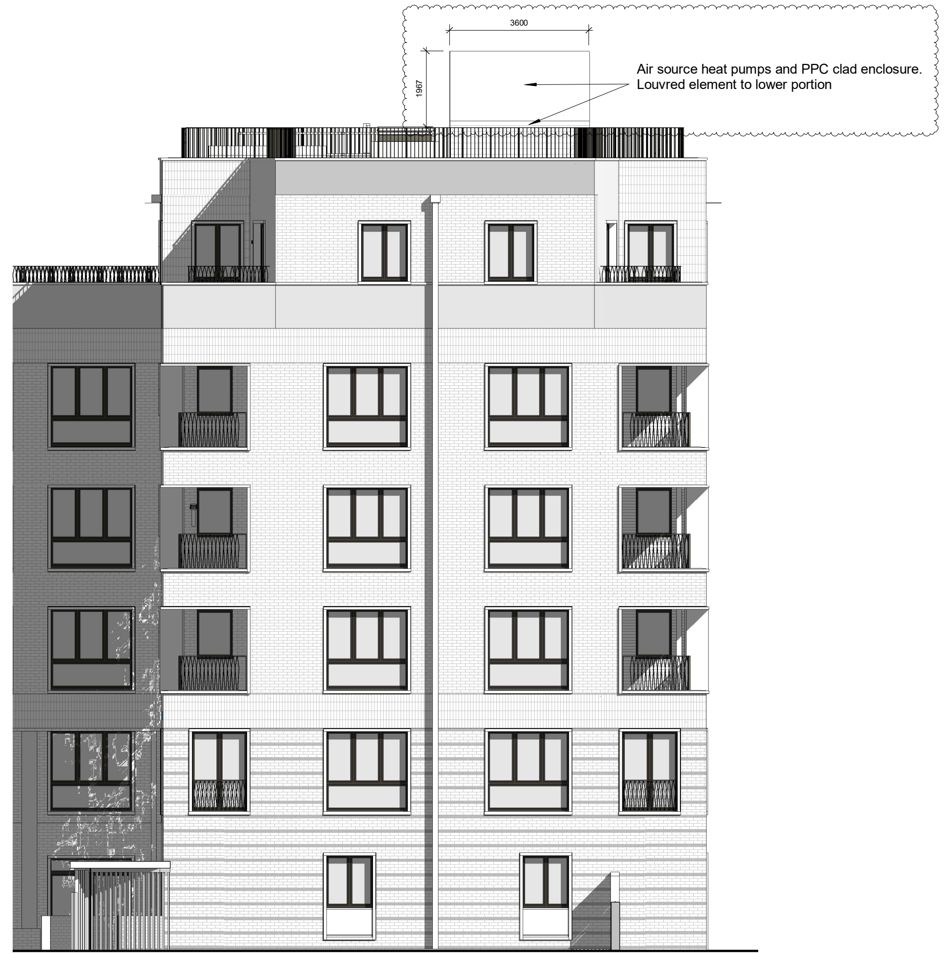
6 South Elevation (Courtyard) - Planning 1 : 100

Copyright Hawkins\Brown Architects No implied licence exists. This drawing should not be used to calculate areas for the purposes of valuation. Do not scale this drawing. All dimensions to be checked on the site by the contractor and such dimensions to be their responsibility. All work must comply with relevant British Standards and Building Regulations requirements. Drawing errors and omissions to be reported to the architect. To be read in conjunction with Architect's specification and other consultant information.