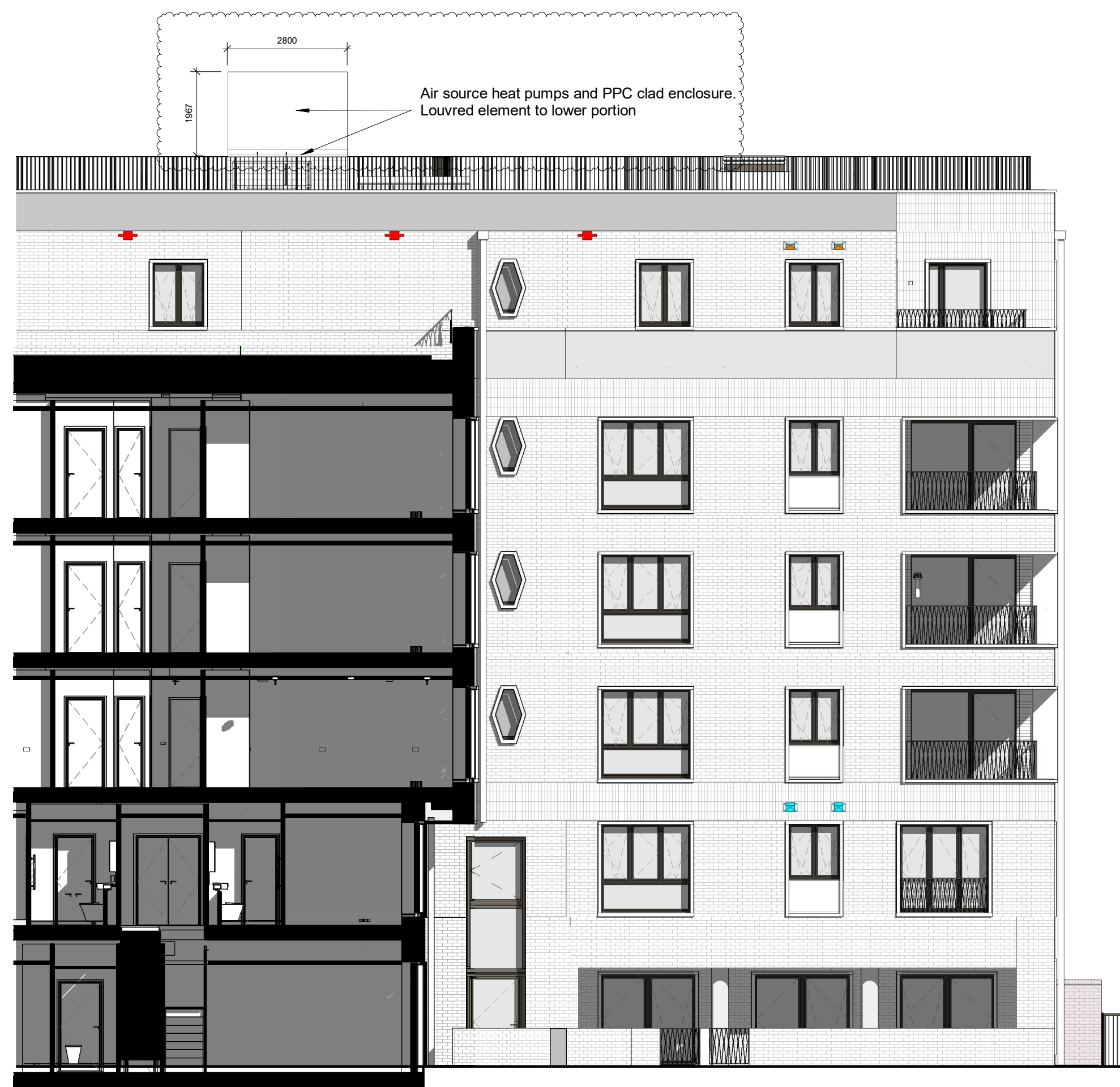
5 West Elevation (Courtyard) - Planning 1 : 100