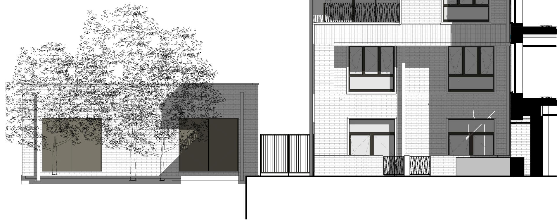
2 North Elevation (Courtyard) - Planning 1 : 100