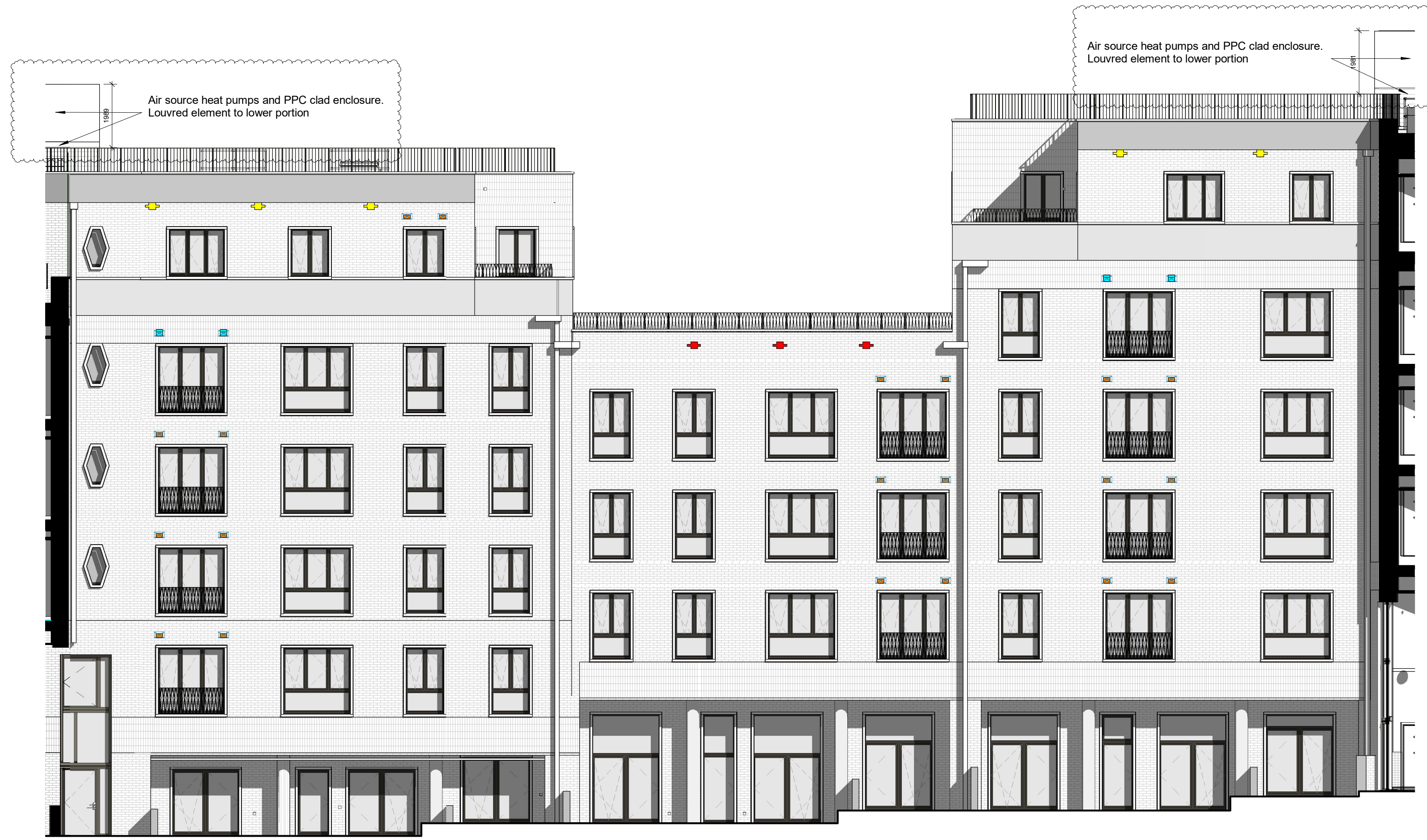
3 East Elevation (Courtyard) - Planning 1 : 100