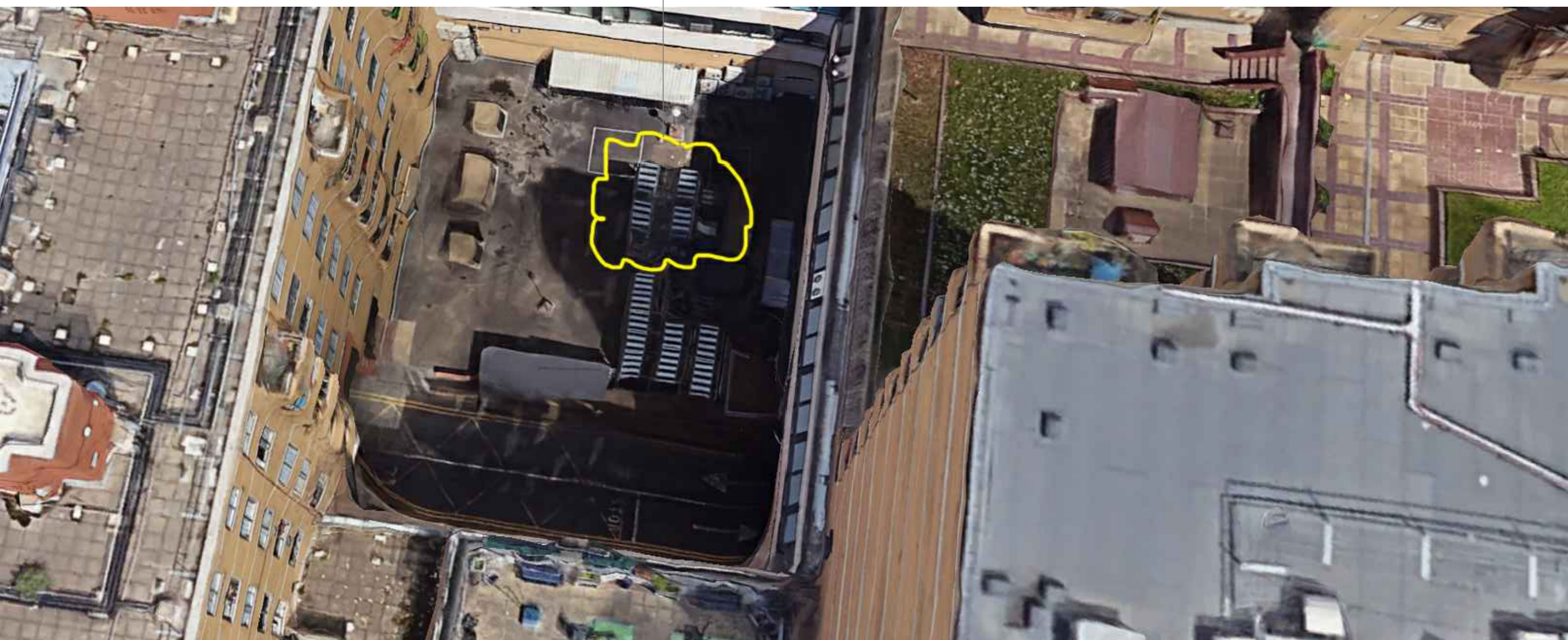
COURTYARD 01 AERIAL IMAGE

COURTYARD 02 EXISTING M&E EQUIPMENT BEING REPLACED LIKE FOR LIKE WITH: • 2 No. Mitsubishi PUZ – ZM35VKA2