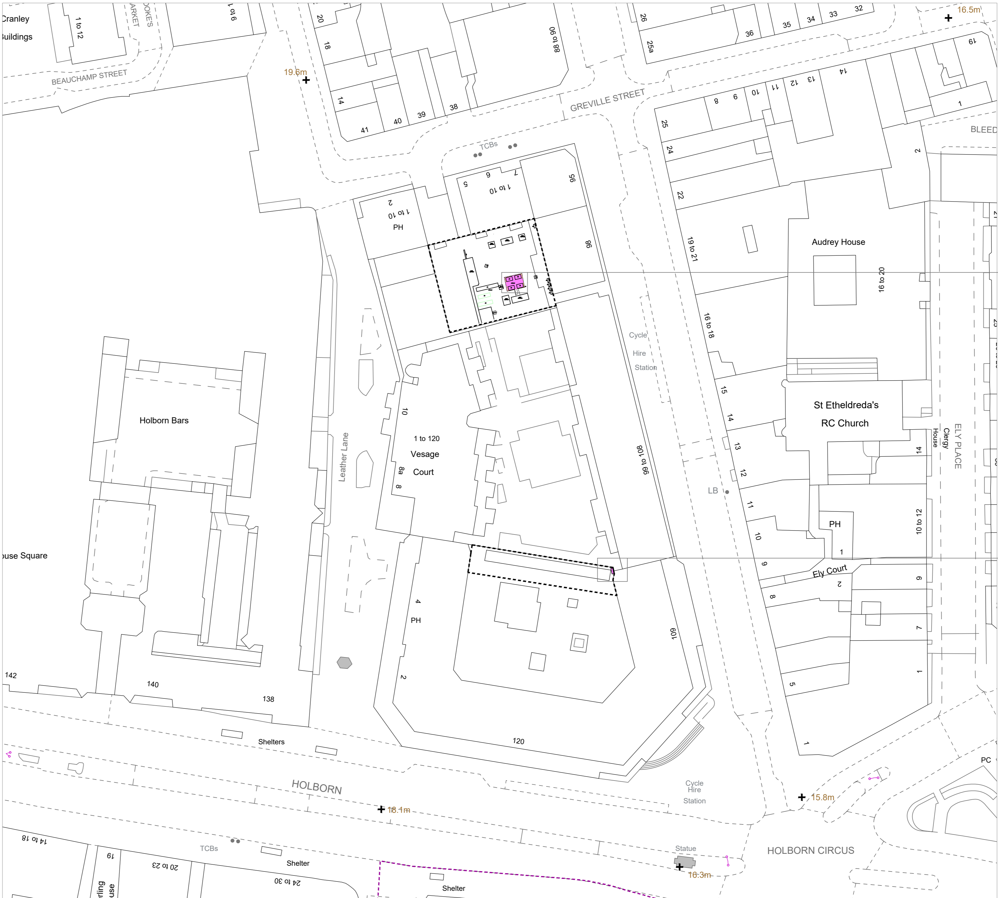
Site Plan 1:500 @ A0

COURTYARD 01 EXISTING M&E EQUIPMENT BEING REPLACED WITH: • 1 No. Mitsubishi PURY – P700YSNW-A2 • 1 No. Mitsubishi PURY – P650YSNW-A2 • 1 No. Mitsubishi PUMY – P250YBM • 1 No. Mitsubishi PUMY – SP125YKM