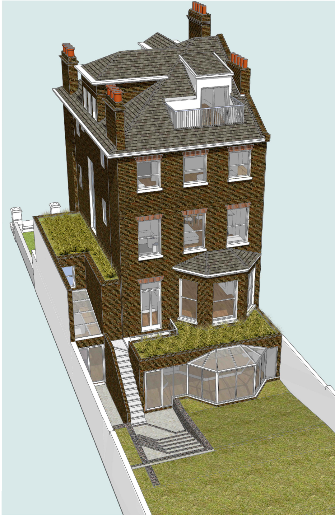
(PROPOSED) SOUTH PERSPECTIVE SCALE: NTS