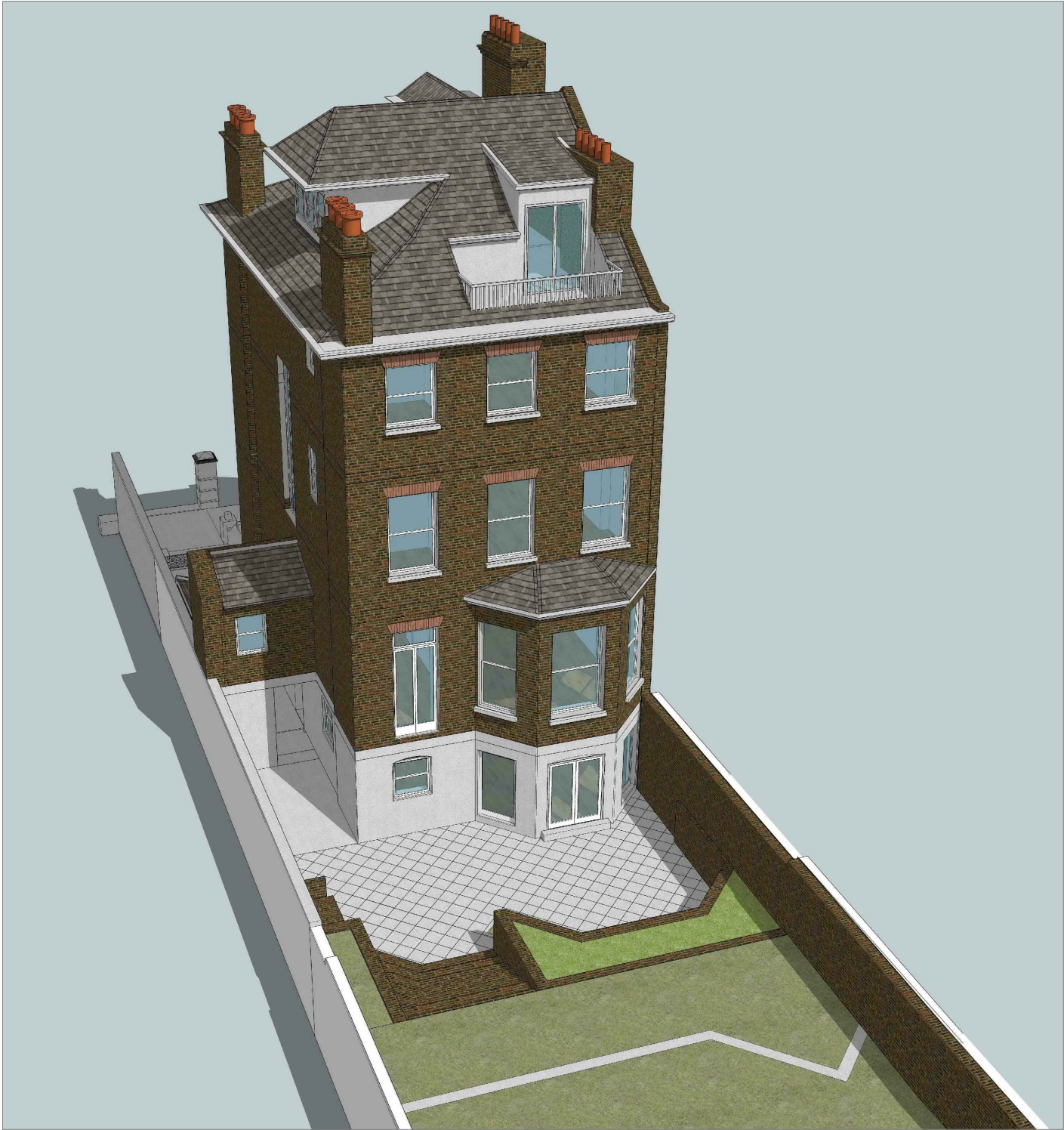
(EXISTING) SOUTH PERSPECTIVE SCALE: NTS