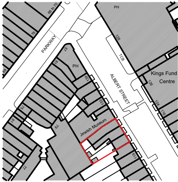
01 Existing Location Plan PL-0.00 1:1250