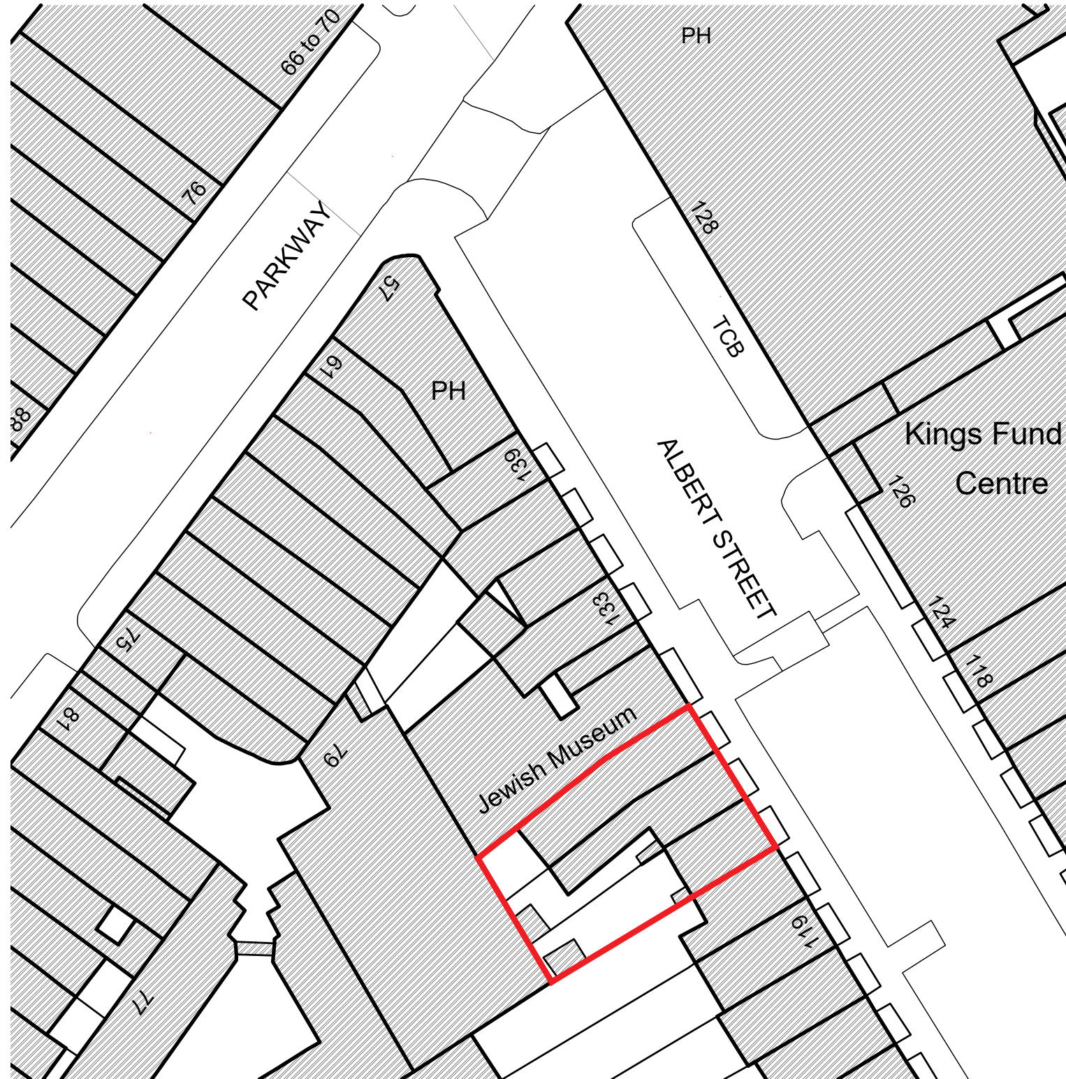
03 Existing Site Plan PL-0.00 1:500