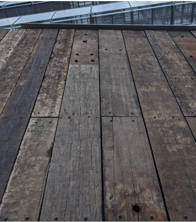
Example: Roundhouse reclaimed timber cladding.