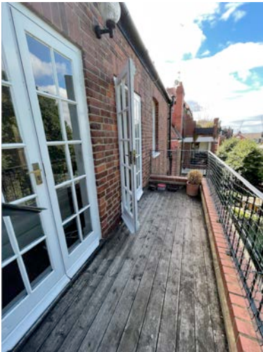
3 - Existing balcony

NOTES: Do not scale from this drawing Check all dimensions on site. Inform architect of any discrepancies Cross-refer to all related documents This drawing is based on a measured survey drawing by CadPlan Ltd. All subject to detailed design and statutory consents.