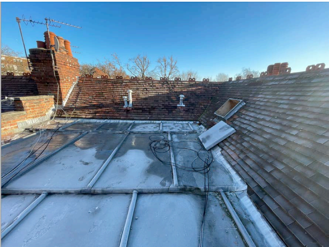
5 - Existing roof looking east towards Langland Gardens

(-) 19 01 23 For planning Revision Project Flat 4 11 Langland Gardens London NW3 6QD Title Site Photographs No. LAN PL 06 Rev: - Status For Information Scale NTS @ A3 Date 01/2023 Edward Rutherford Architect www.edwardrutherford.co.uk