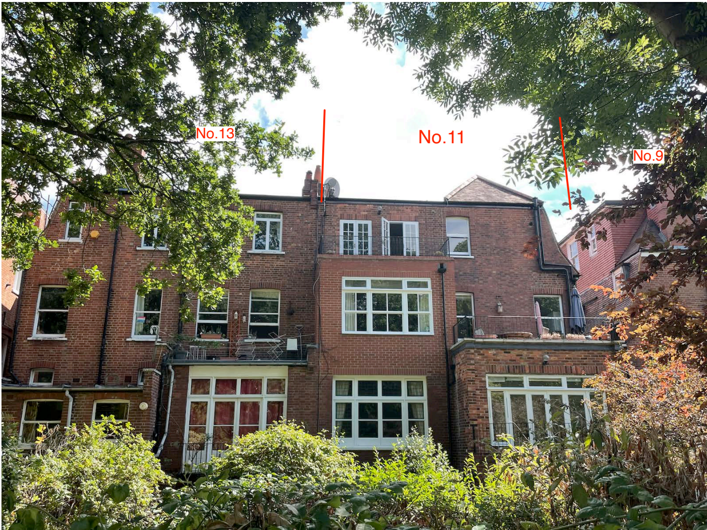
1 - West Elevation