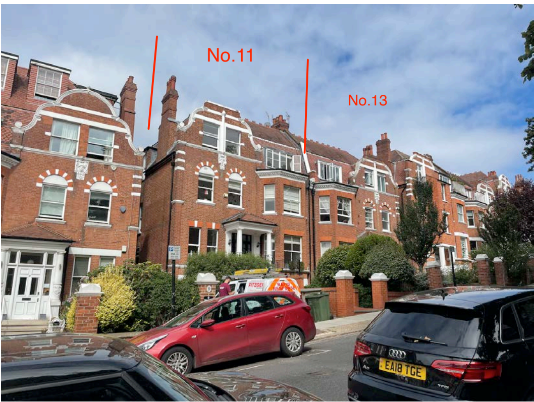
2 - View from street

NOTES: Do not scale from this drawing Check all dimensions on site. Inform architect of any discrepancies Cross-refer to all related documents This drawing is based on a measured survey drawing by CadPlan Ltd. All subject to detailed design and statutory consents.