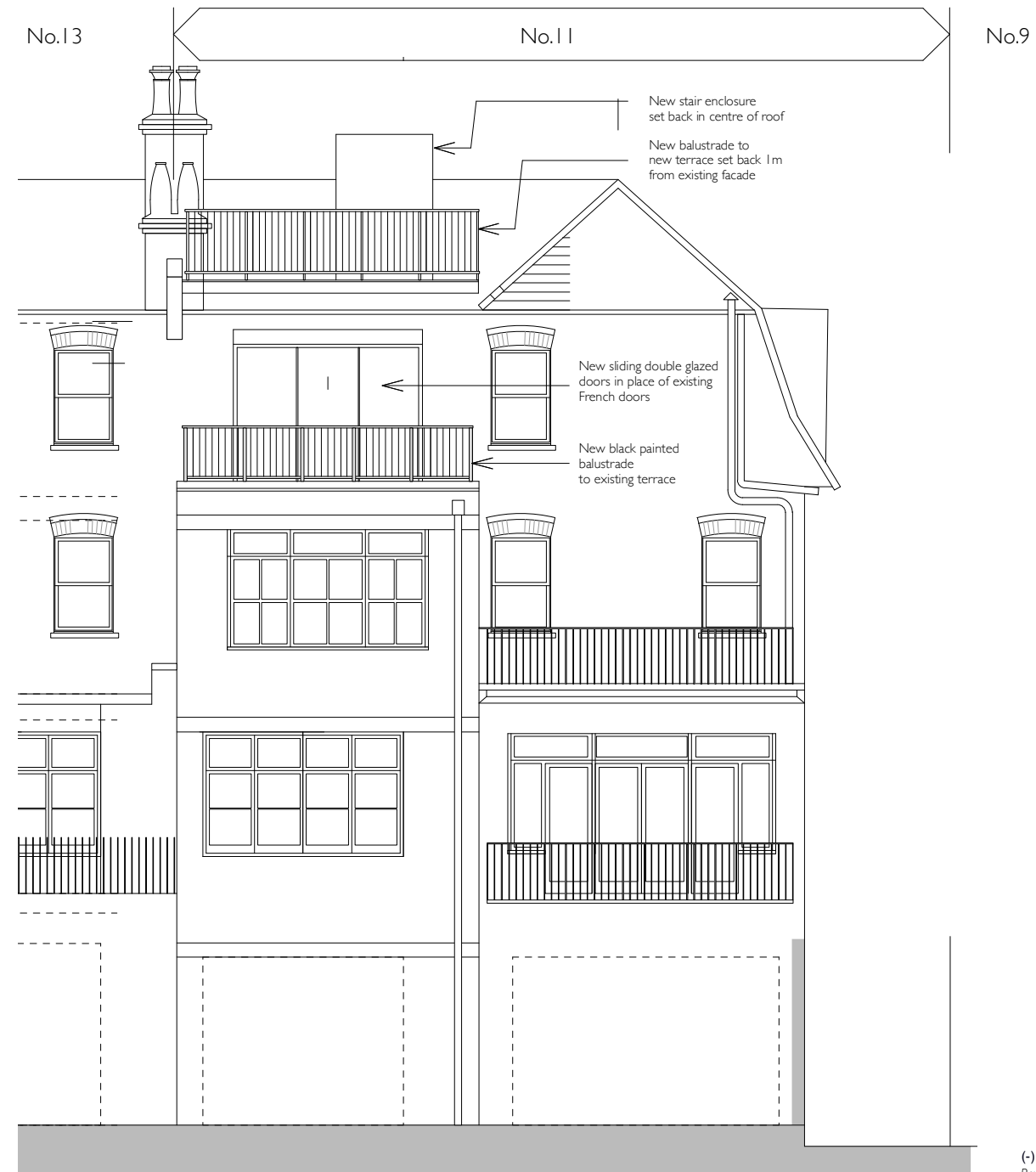
1 Existing West Elevation 1:100