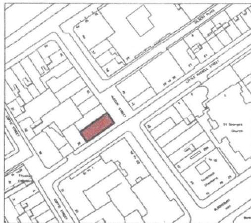
SITE LOCATION PLAN ( scale 1:100 )