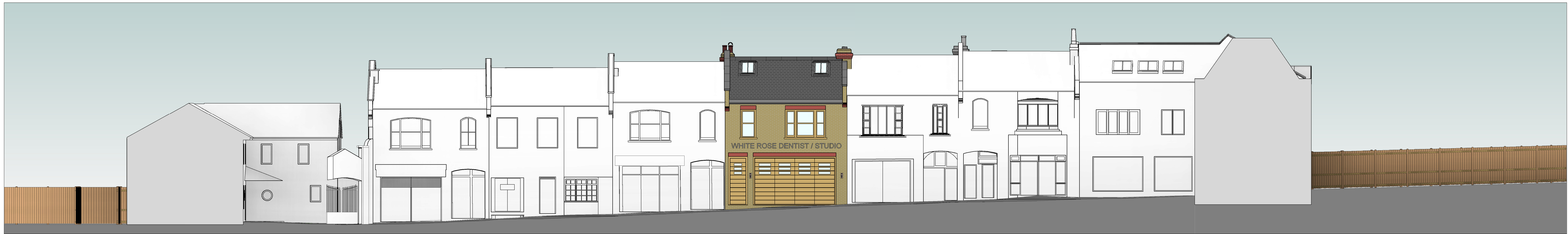
3 STREET SECTION 1 1 : 100