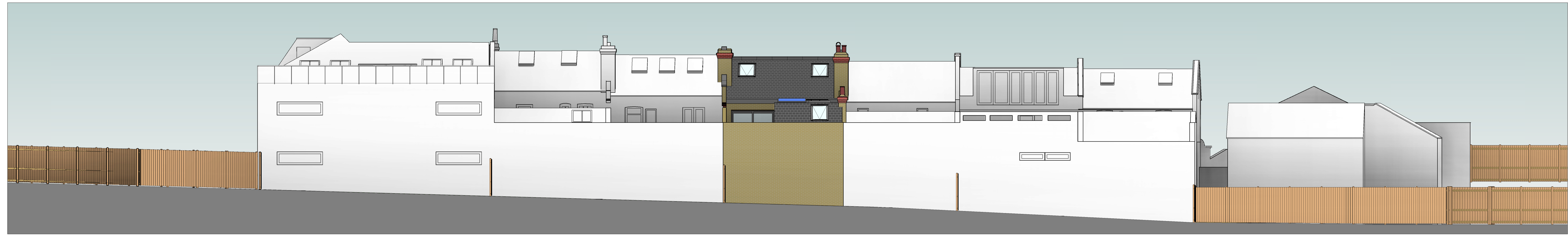
4 STREET SECTION 2 1 : 100