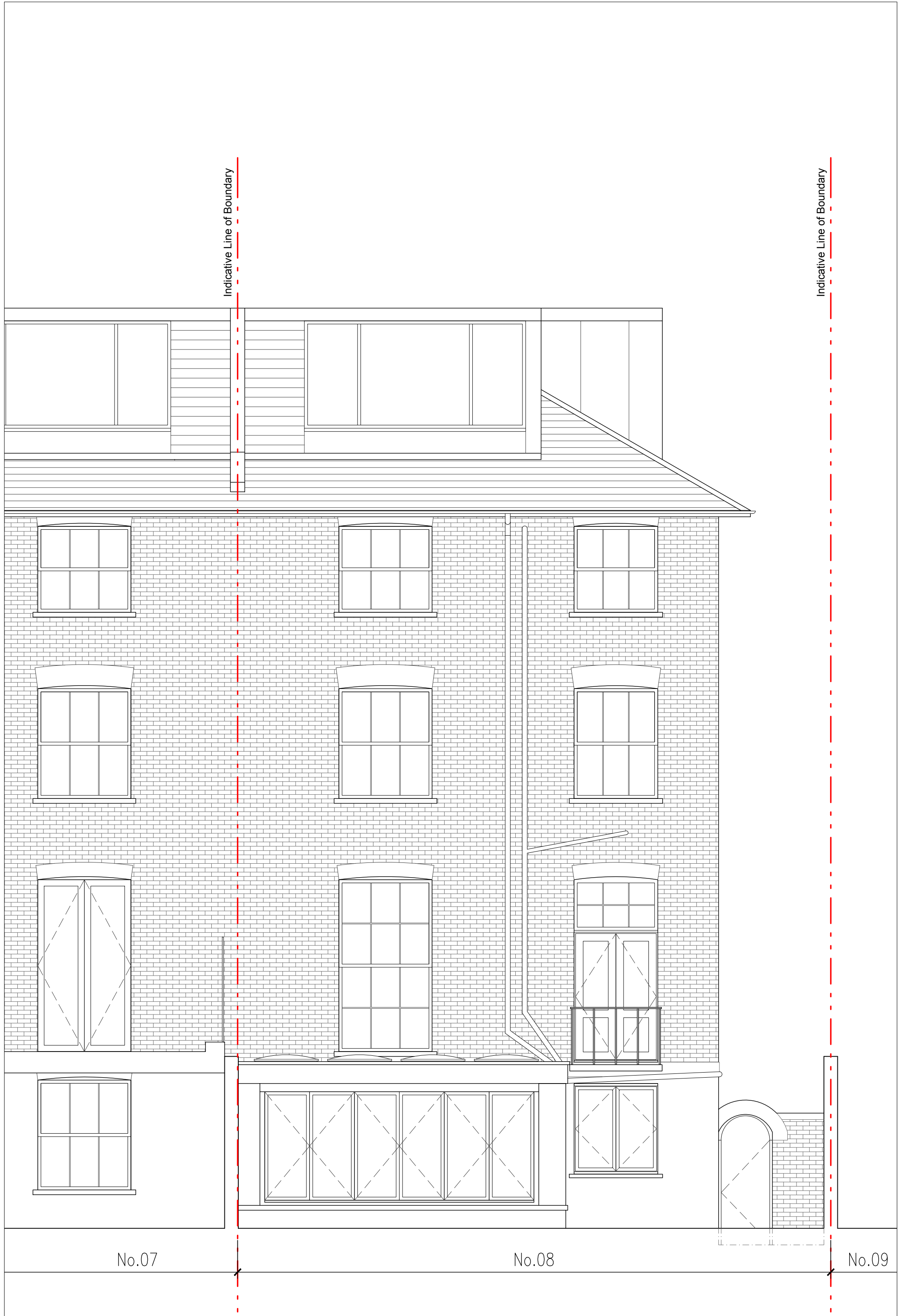
Existing South East | Rear Elevation Scale 1:100 @ A3 | 1:50 @ A1