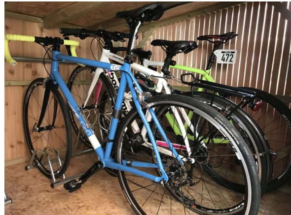
Slot-in Bike Shed - Brighton Bike Sheds