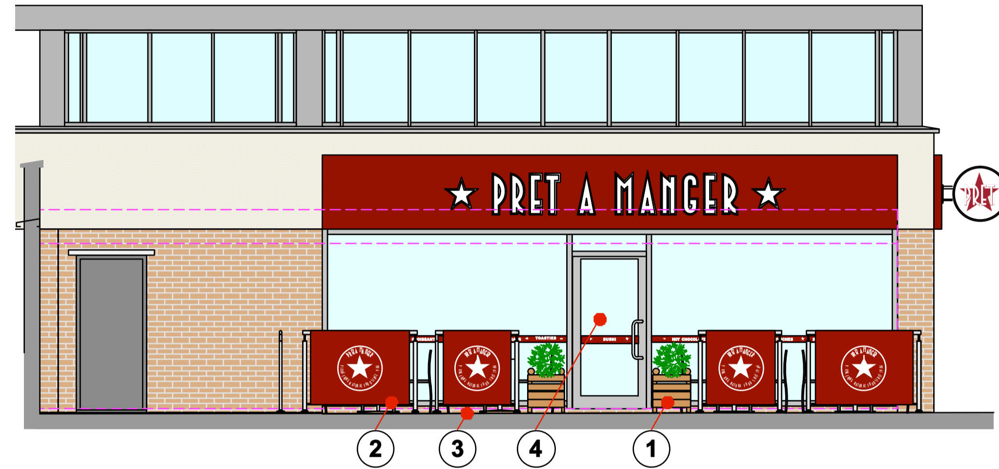
Proposed External Elevation - Herbrand Street