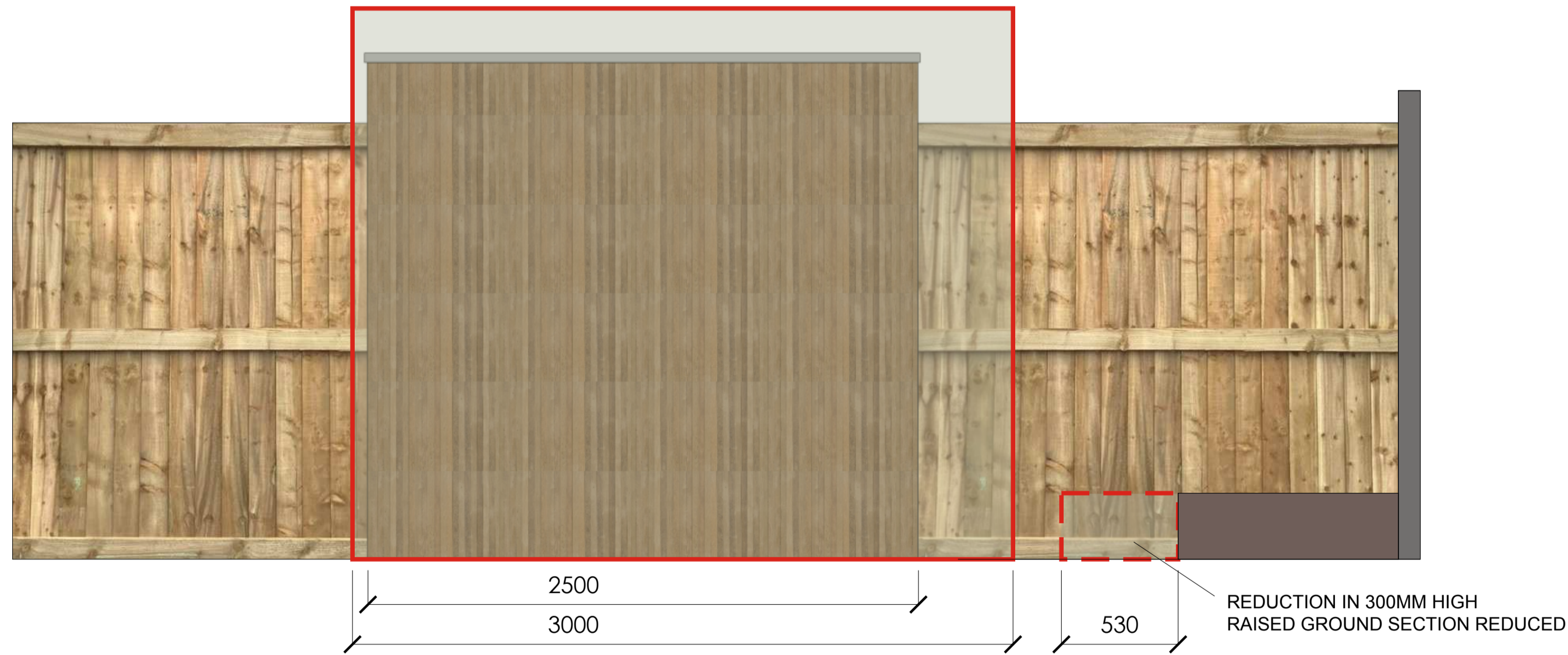
SIDE ELEVATION EXISTING SHED AND PROPOSED ROOM SHOWN IN RED