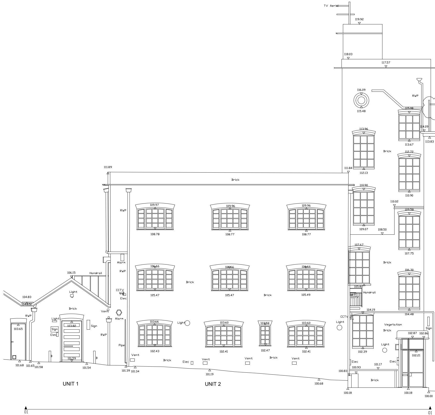
Existing North Elevation